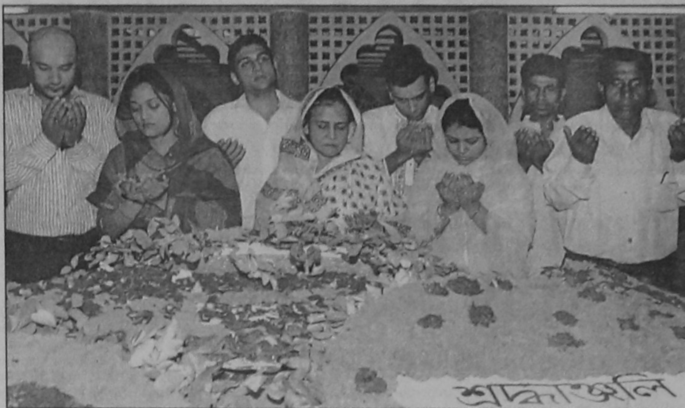
Family members of Sher-e-Bangla AK Fazlul Huq offer fateha after placing wreaths at his mazar on the occasion of his 46th death anniversary in the city yesterday.