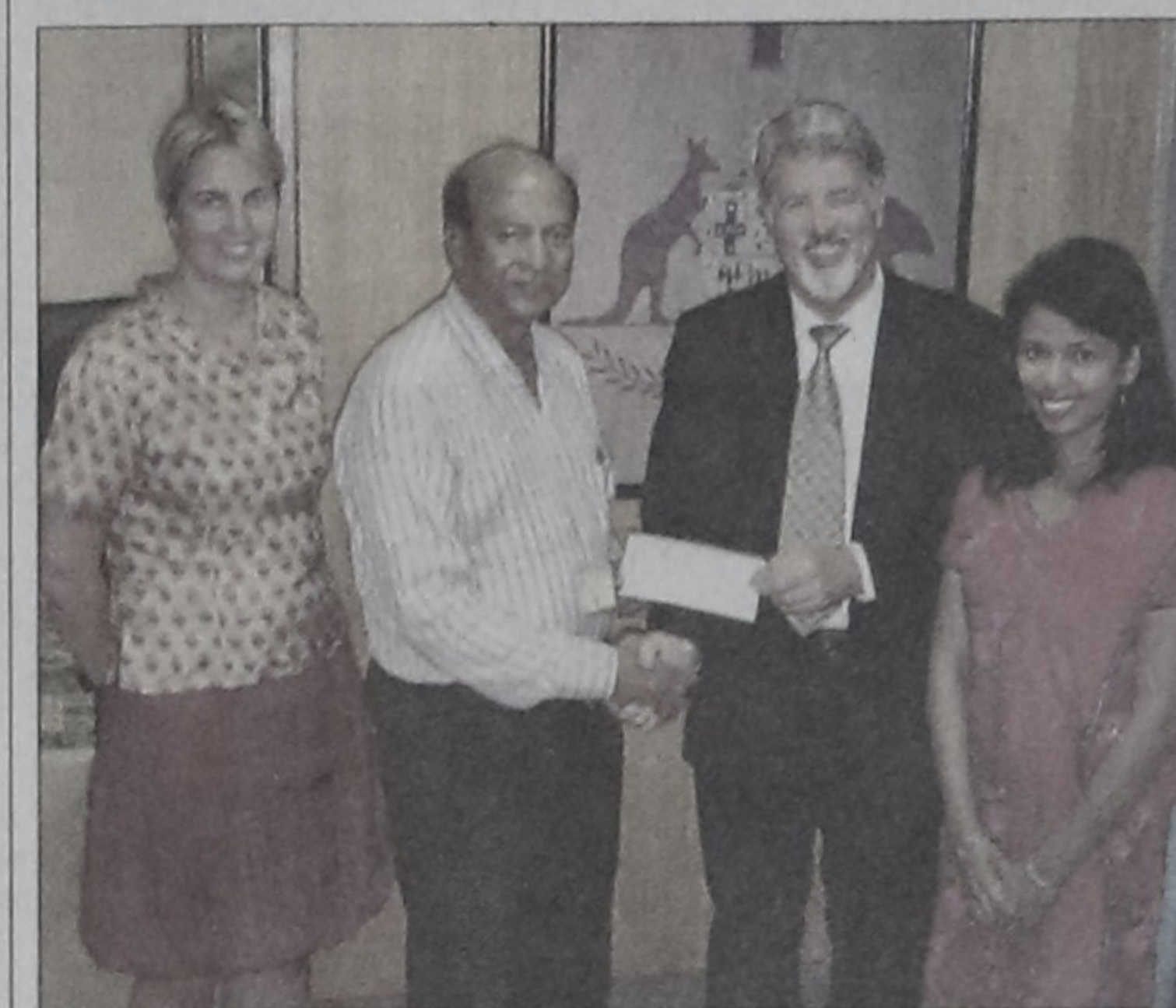
Australian High Commissioner in Bangladesh Douglas Foskett hands over a cheque for Tk 4.9 lakh to Rafiqul Islam of Good Earth, an NGO, for persons with disabilities.

Deputy High Commissioner Kilmey Beckering Vinckers was also present on the occasion.