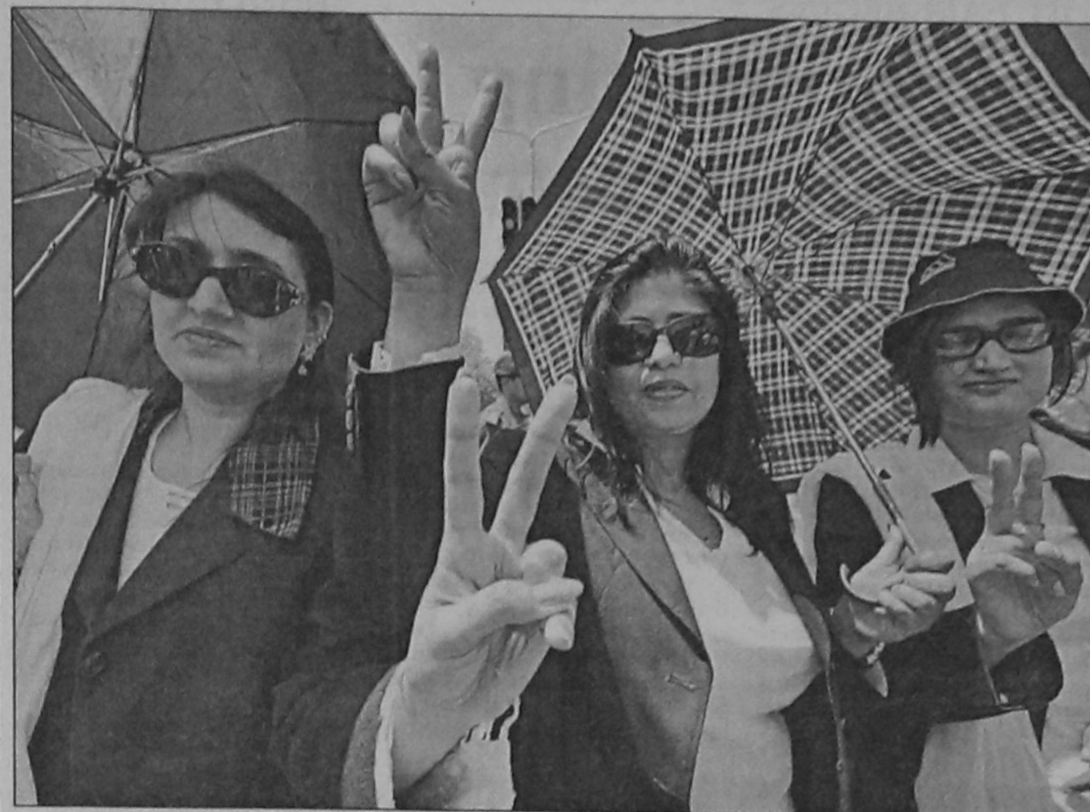
Pakistani lawyers and political activists protest in Lahore on Thursday demanding the reinstatement of judges sacked by President Pervez Musharraf. Pakistani Information Minister Sherry Rehman said that the Pakistan's ruling coalition has set up a committee to implement their understanding on reinstatement of judges.

"We also stopped transporting students and officials in the Gaza Strip," he told AFP. "Not a litre of fuel came from Israel."