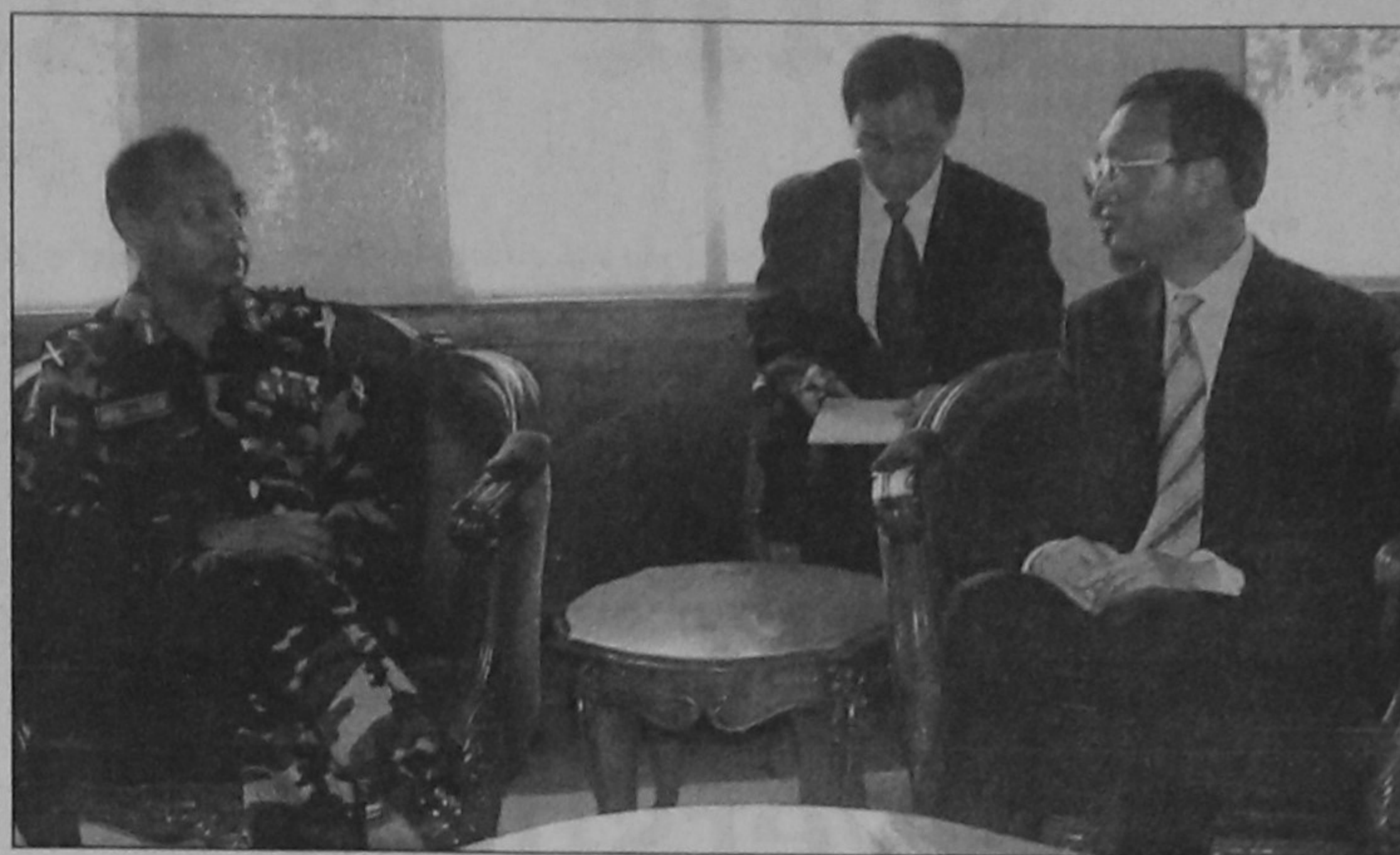
Chinese Foreign Minister Yang Jiechi calls on Chief of Army Staff General Moeen U Ahmed at Army Headquarters at Dhaka Candonment yesterday.

Among others, former naval chiefs and presidents of Bangladesh Navy Family Welfare Association, retired naval officers and their spouses and senior officers of Naval Headquarters were present on the occasion.