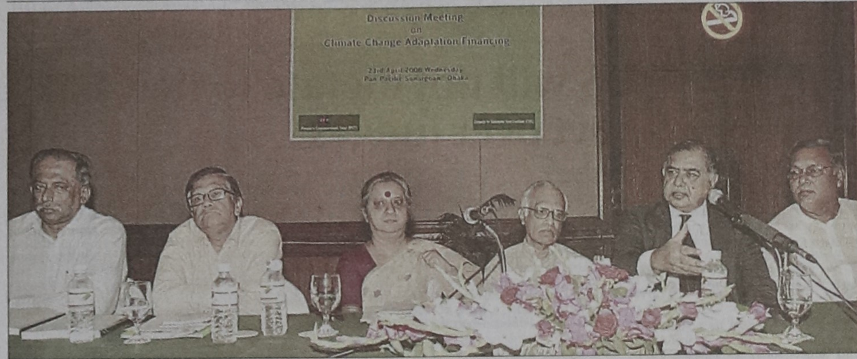
Eminent jurist Dr Kamal Hossain speaks at a discussion titled 'Climate Change Adaptation Financing' at Hotel Sonargaon in the city yesterday. Campaign for Sustainable Rural Livelihood (CSRL) and People's Empowerment Trust (PET) jointly organised the discussion.

The bodies have been sent to Jhenidah Sadar hospital morgue for autopsy.