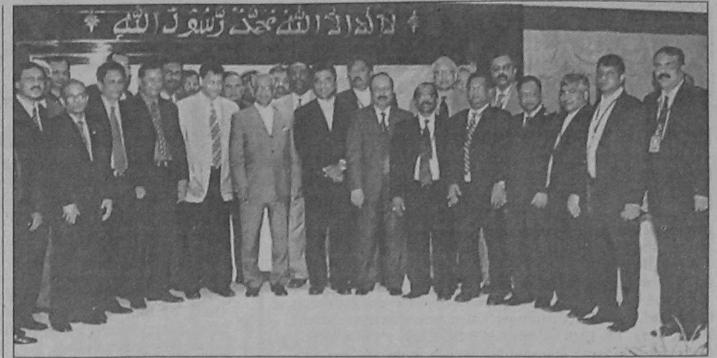
The newly executive committee members of Federation of Bangladesh Chambers of Commerce & Industry (FBCCI) met Chief Adviser Dr Fakhruddin Ahmed in Dhaka yesterday.