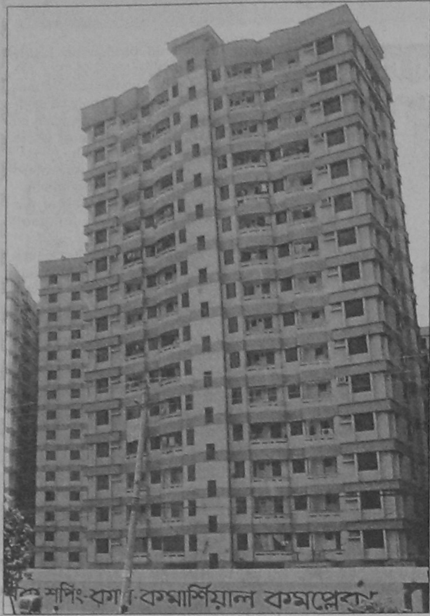
A view of Japan Garden City, the largest housing block in the capital. Bangladesh Bank is reviewing its low-cost housing loan rules for the middle and lower income group.