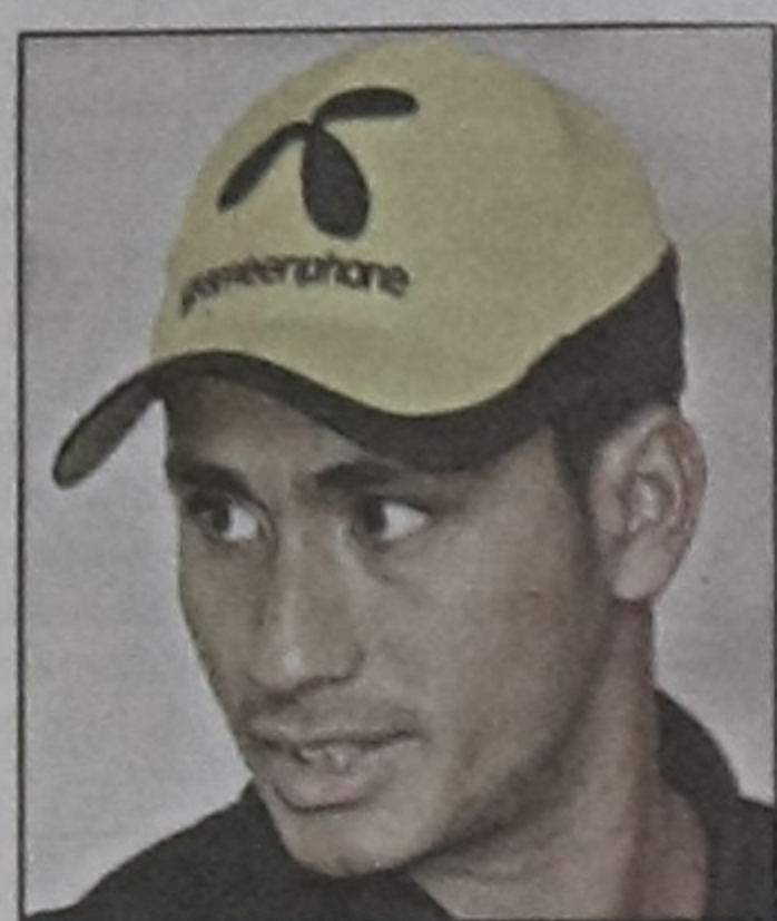
Mohammad Ashraful (Bangladesh cricket captain)

"I think our performance was much better than our previous two series against New Zealand and South Africa. I believe we were competitive in the series if you considered our performance in the last two series. You know we have a long-term plan towards the World Cup of 2011."