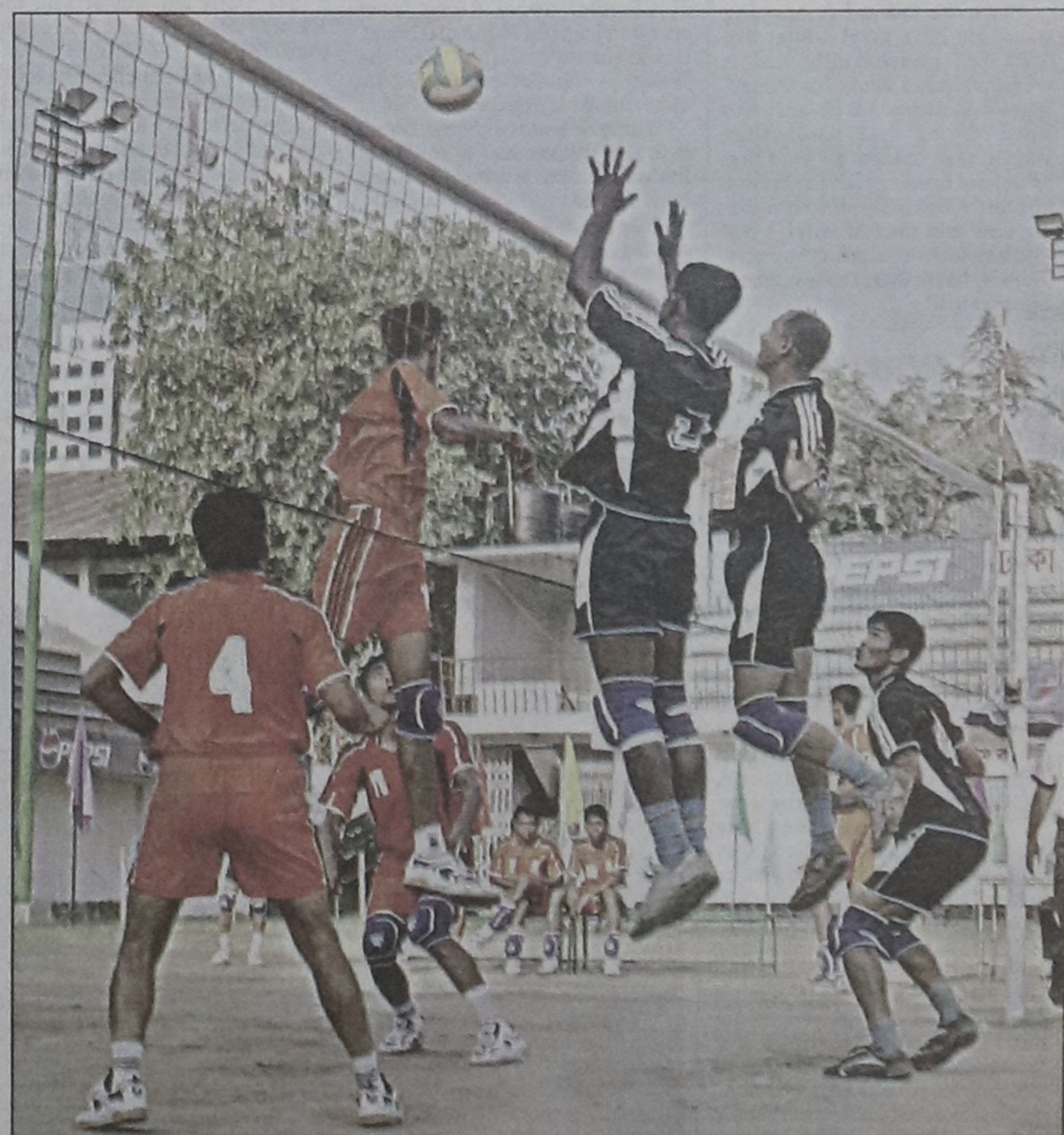
Action from yesterday's Metropolis Premier Division Volleyball league match between Power Development Board and Fire Service at the Volleyball Court adjacent to the Bangabandhu National Stadium.