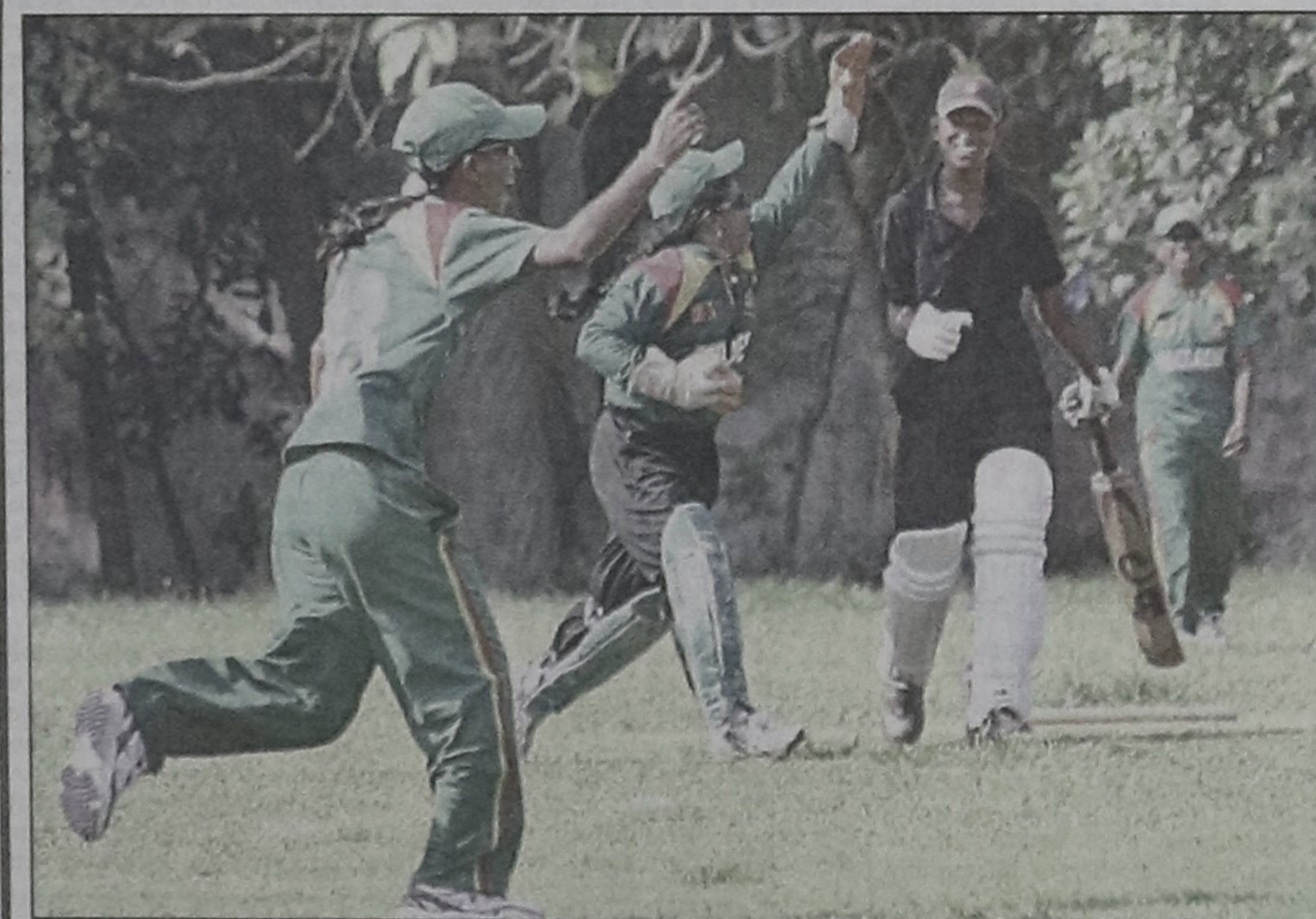
Bangladesh women cricketers celebrate after their win against Under-16 boys team at the Dhanmondi Women's Sports Complex yesterday. The women's team played the game as part of their build-up for the Asia Cup, beginning in Sri Lanka from April 27.