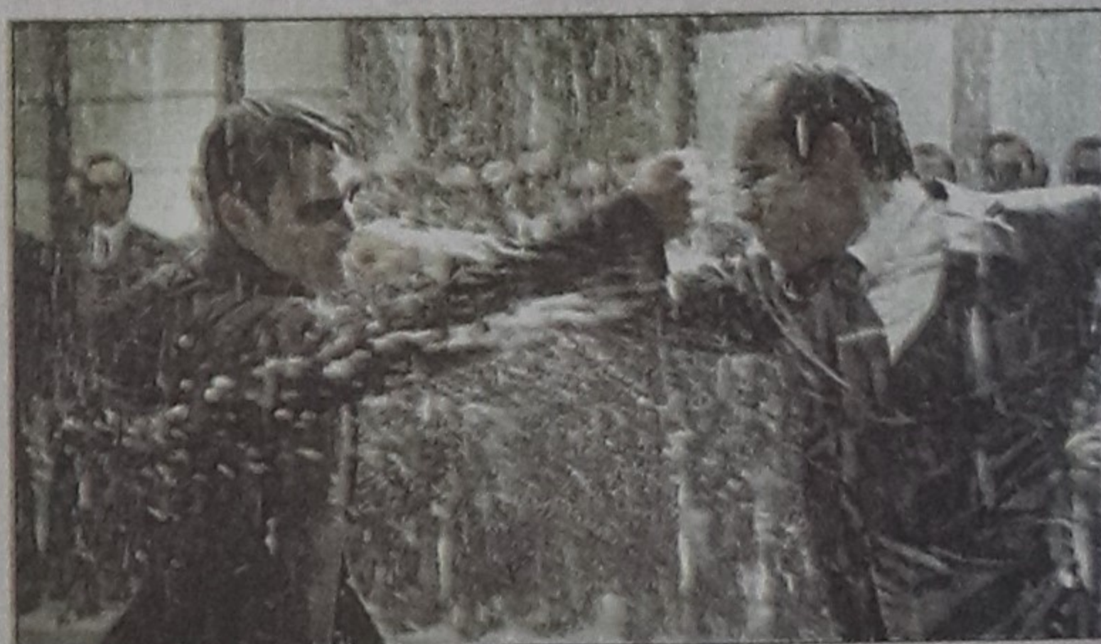
The Matrix Revolutions On Zee Studio at 8:10 pm Genre: Action/ Sci-Fi Cast: Keanu Reeves, Carrie-Anne Moss, Laurence Fishburne

11:35 Talk Show: Ei Shomoy BANGLAVISION 08:30 Children's Programme: Ichchhey Ghuri 09:00 Children's Programme: Ebong Class-er Bairay