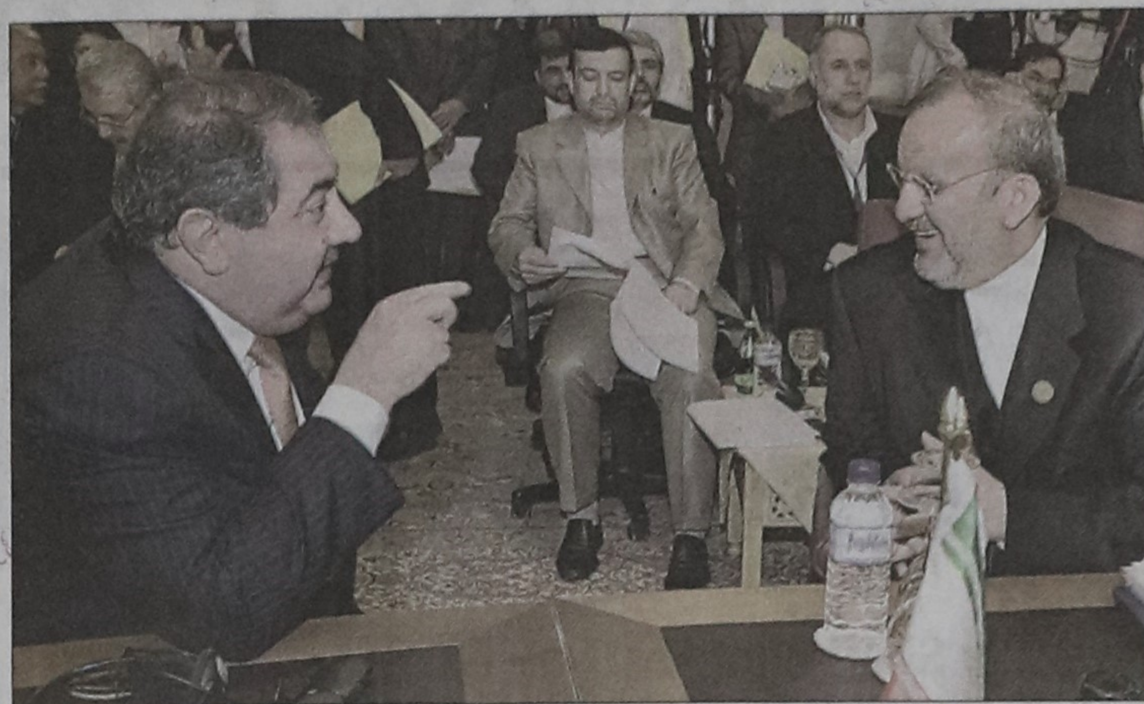
Iraqi Foreign Minister Hoshiyar Zebari (L) talks with his Iranian counterpart Manouchehr Mottaki during the opening session of a ministerial conference on Iraq in Kuwait City yesterday. Iraq, backed by the United States, urged its Sunni Arab neighbours Tuesday to offer diplomatic and economic support to a "new Iraq" that promotes national unity and ends sectarian divisions.

Since a surprise visit to Baghdad on Sunday, US Secretary of State Condoleezza Rice has been urging Arab states in meetings in Bahrain and now in Kuwait City to throw their support behind a new "non-sectarian" Iraq.