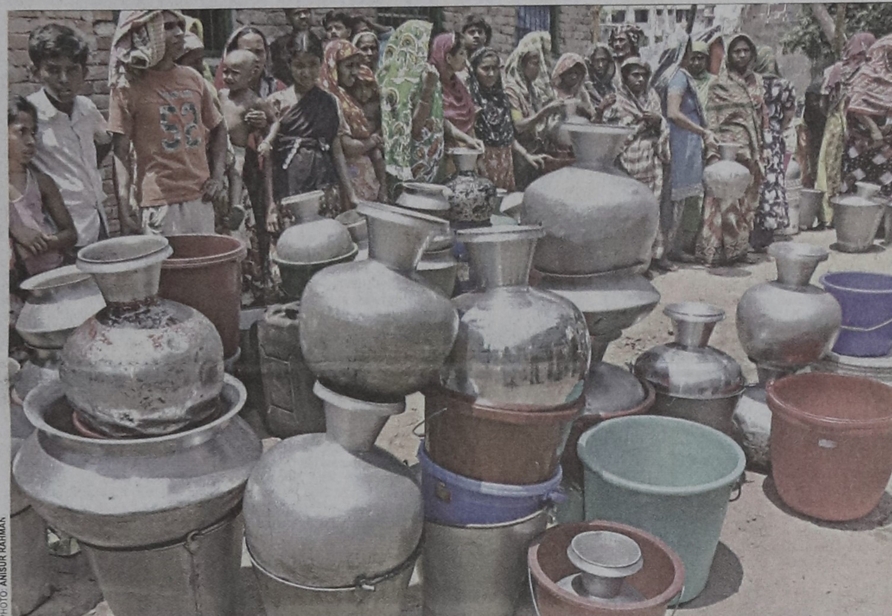
Residents of Pikepara of Mirpur in the capital queue up with their vessels yesterday and wait for a Dhaka Wasa water tanker as the area has been experiencing acute water crisis for more than a month.