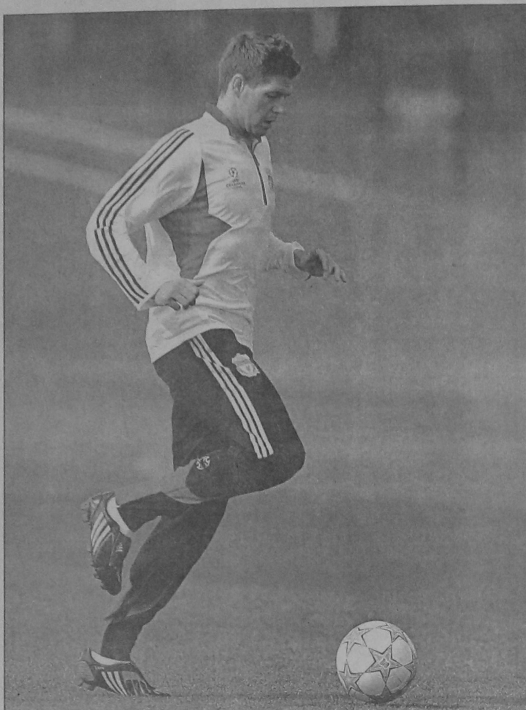
Liverpool's inspirational midfielder Steven Gerrard dribbles with the ball during a training session at their Melwood training ground in Liverpool yesterday. Liverpool fans across the world would be expecting Gerrard to be fit for the crunch Champions League first-leg semifinal clash against Chelsea at Anfield tonight.

"After a while people talked about the Champions League, then the UEFA Cup then it was heads down for a bit but recently we have come back and are playing rather good football."