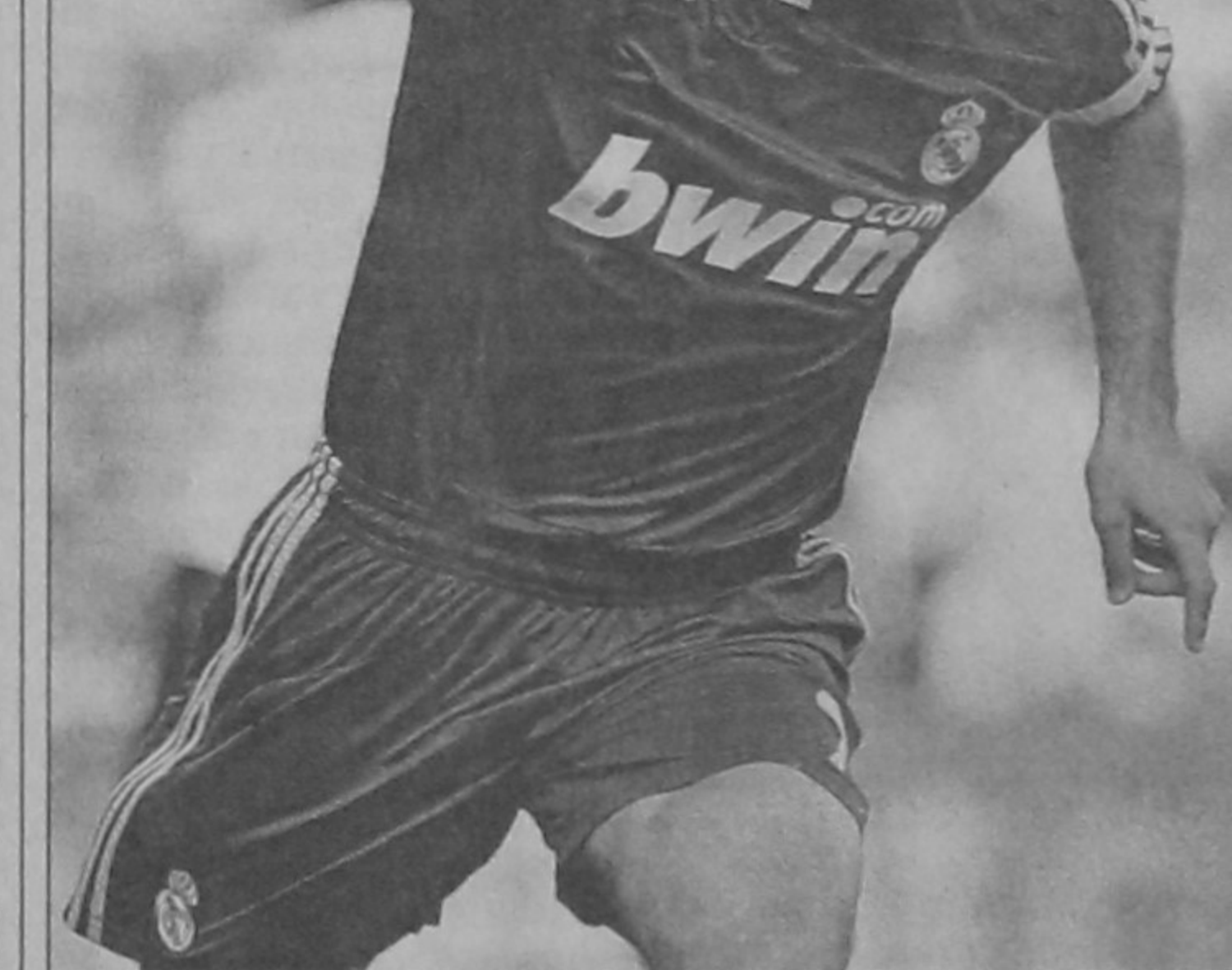
Real Madrid striker Raul Gonzalez celebrates after scoring against Racing Santander during their Primera Liga clash at the Sardinero Stadium in Santander on Sunday.

Racing immediately tried to respond but their repeated attacks were thwarted by Real's back four of Gabriel Heinze, Fabio Cannavaro, Pepe and Sergio Ramos.