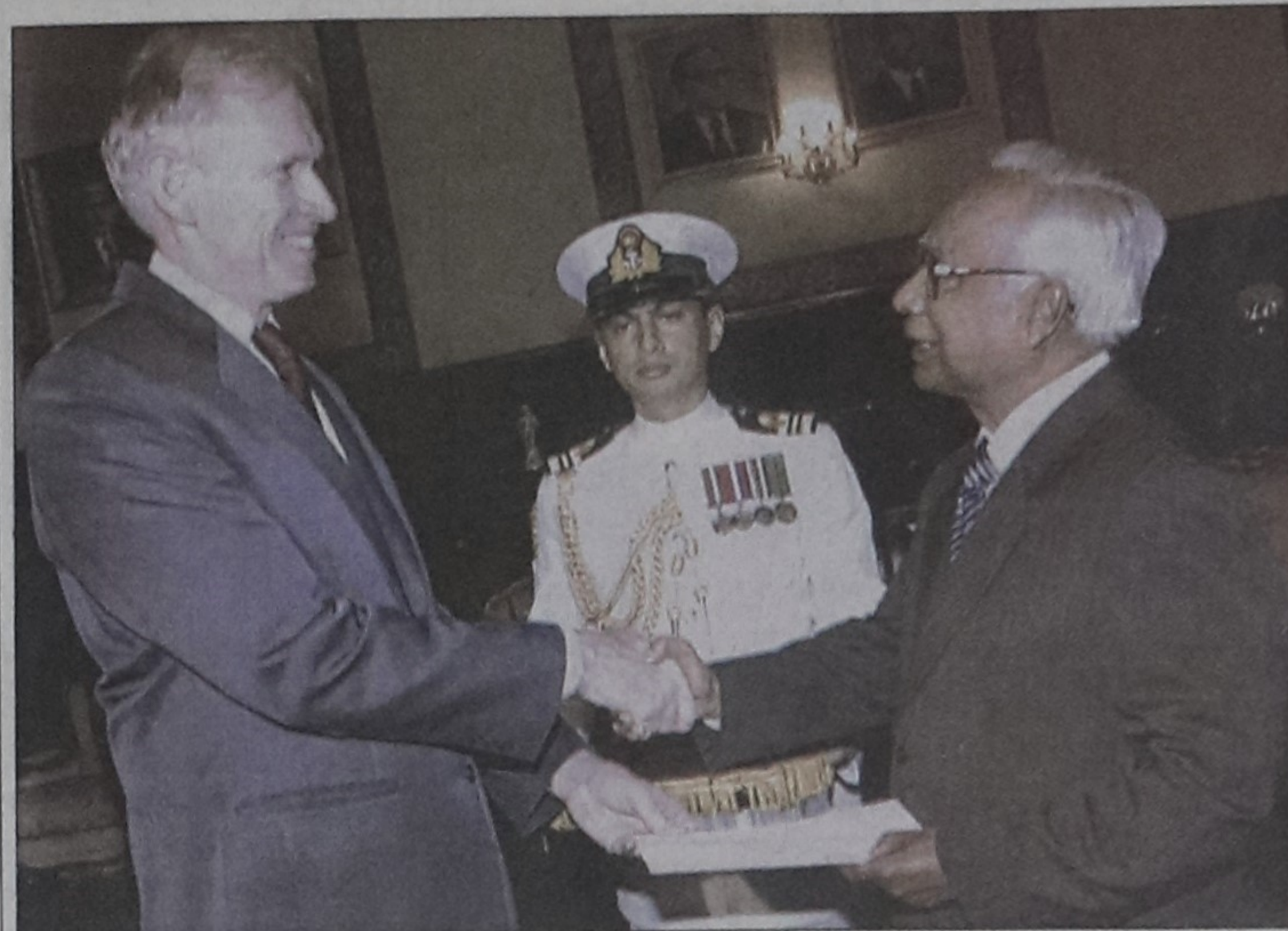
Newly appointed US Ambassador to Bangladesh James F Moriarty presents his credentials to President Iajuddin Ahmed at Bangabhaban in the city yesterday. (Story on Page-1)

They also condemned the remarks of some fundamentalist groups against the women development policy.