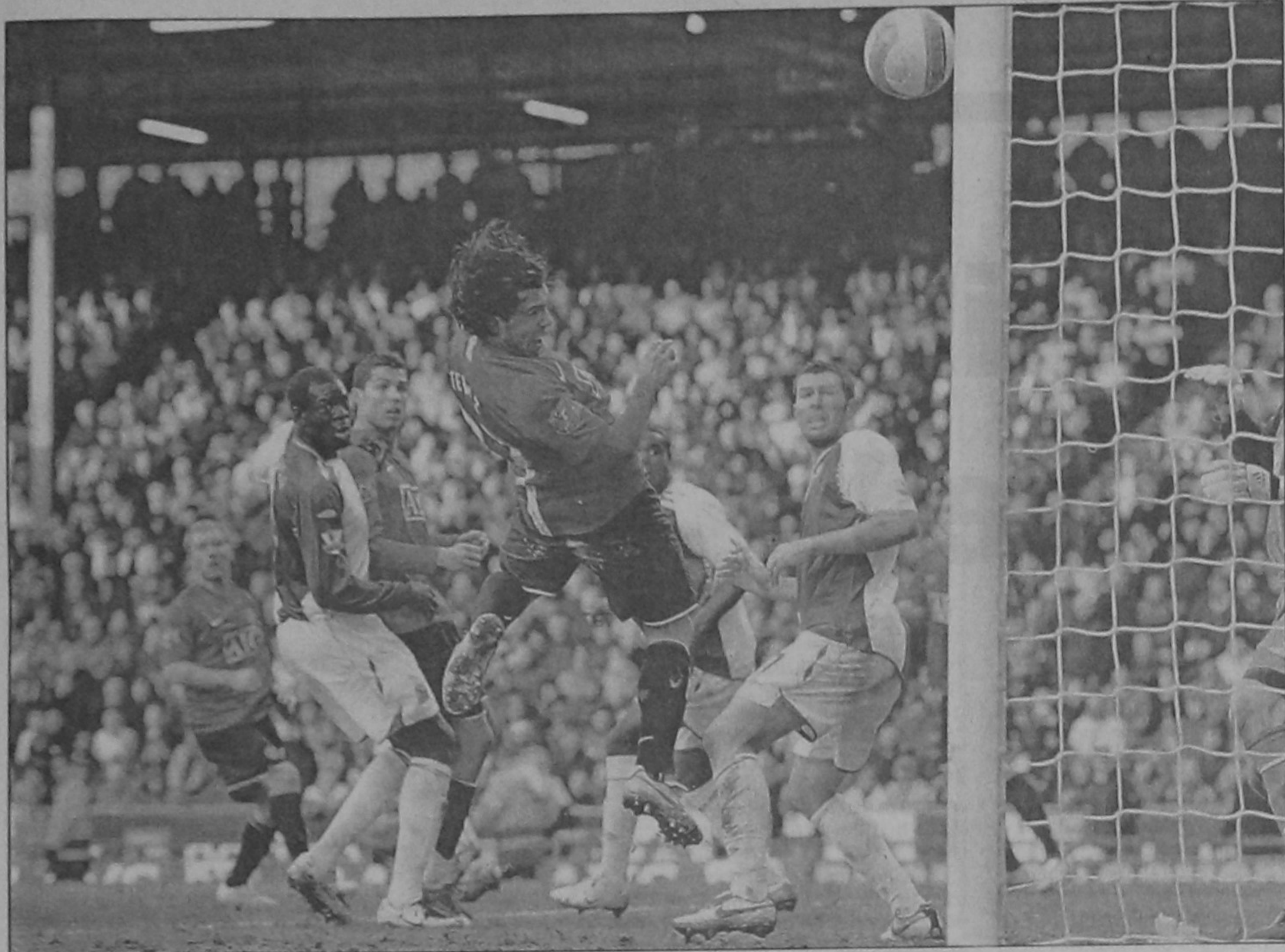
Manchester United striker Carlos Tevez (C) scores the equalising goal with an acrobatic header against Blackburn Rovers during their Premiership encounter at Ewood Park in Blackburn on Saturday.