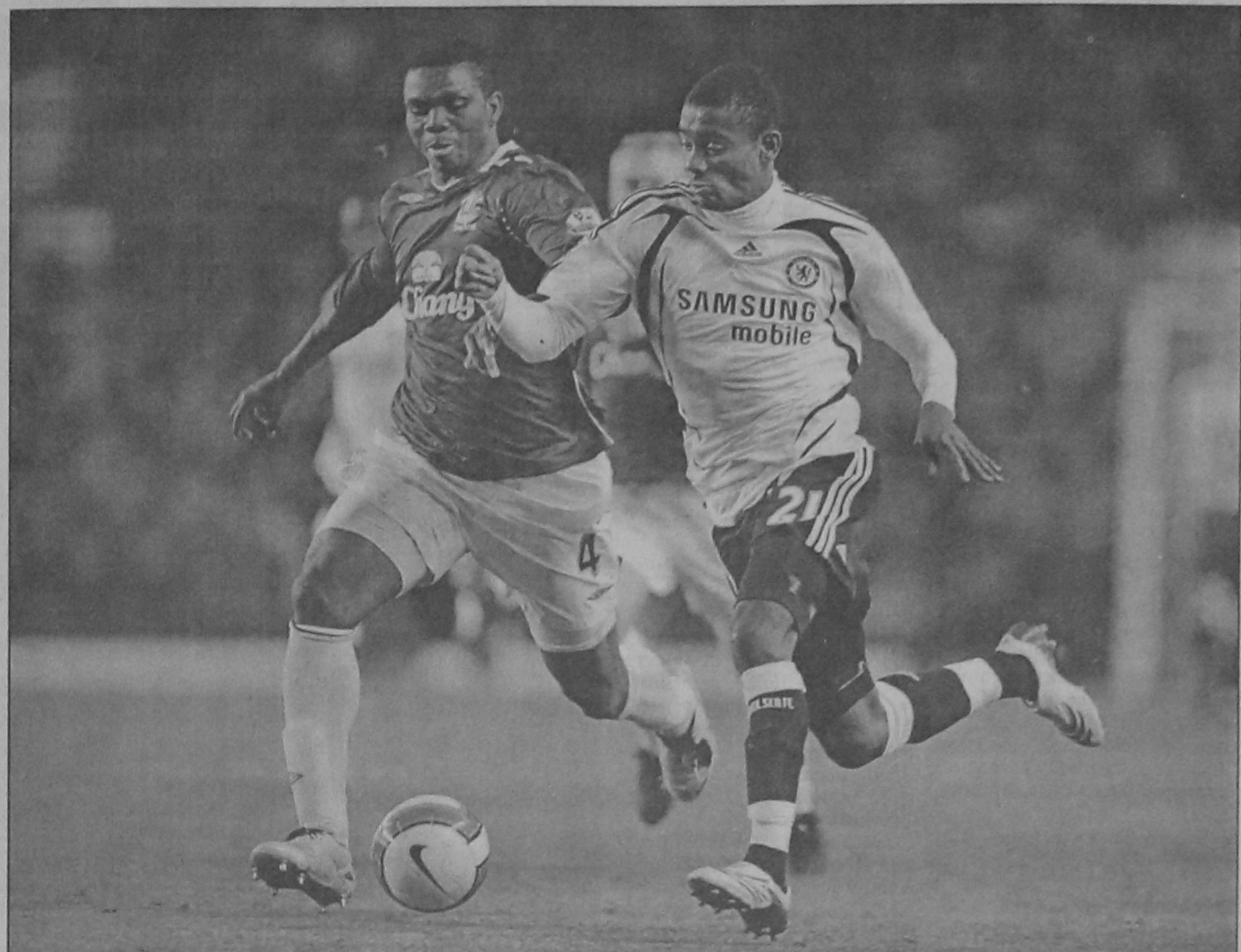
Chelsea forward Salomon Kalou (R) tries to get past Everton defender Joseph Yobo during their Premiership encounter at Goodison Park on Thursday.

It was the nearest Everton came to levelling the match yet the way Chelsea's players celebrated at the final whistle proved how relieved they were to emerge with three points.