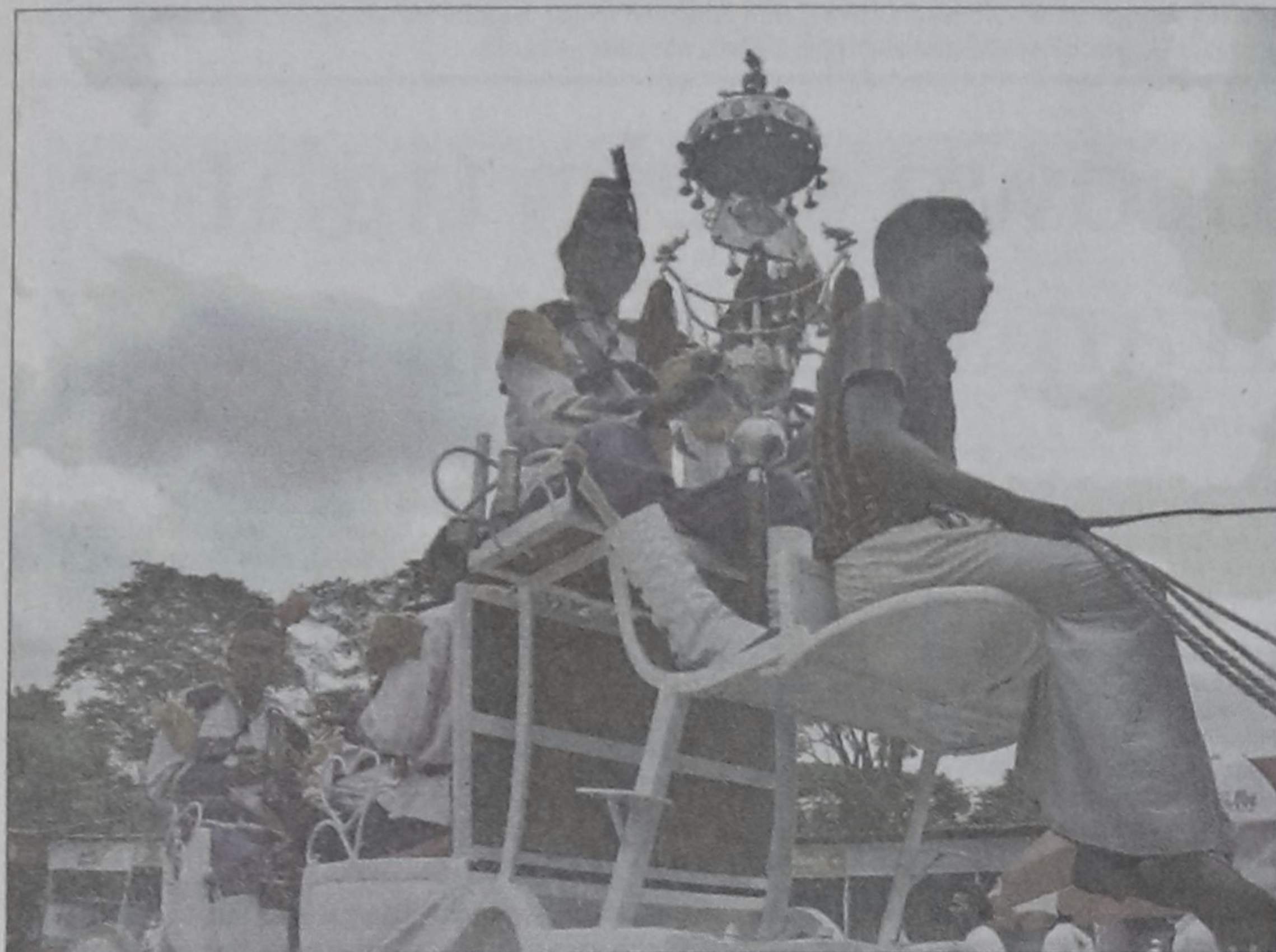
A horse and carriage at the festival