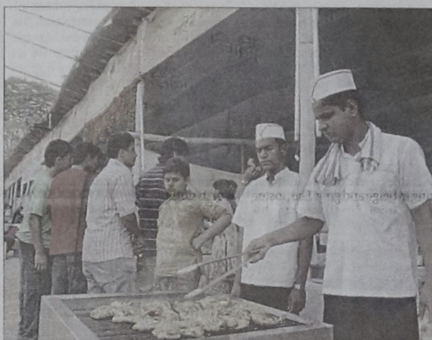
Chicken on the grill lure foodies

Sponsored by City Group and RC Cola, the event is managed by Spellbound. The Daily Star , Dainik Jugantor and ATN Bangla are the media partners and Radio Foorti is the radio partner of the festival.