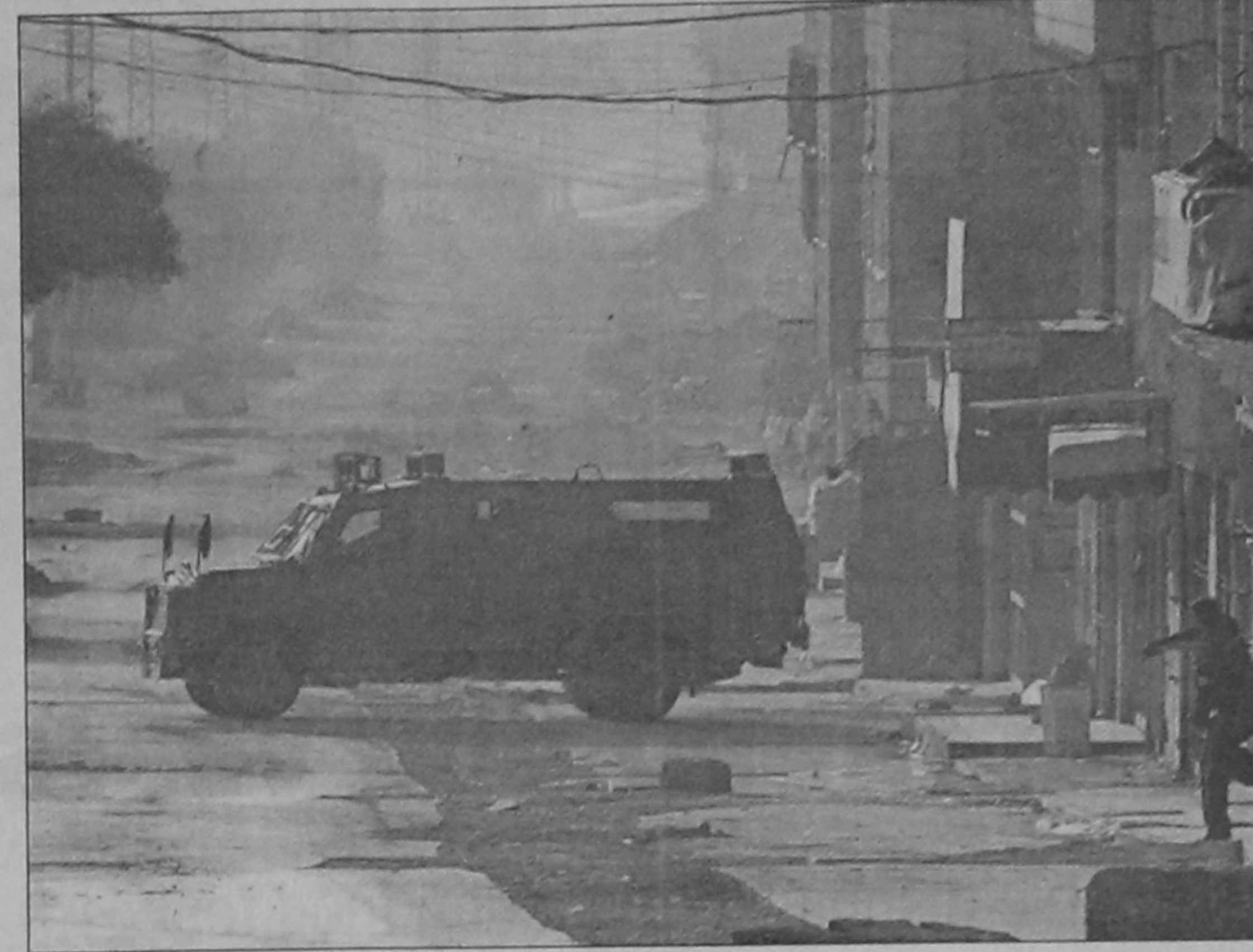
A Palestinian man throws stones at an Israeli army armored vehicle in the Balata refugee camp, near Nablus, following clashes in which Palestinian militant Hani al-Kaabi was killed yesterday.

Israel's army confirmed that a militant had been killed in an operation in Nablus, saying he fired at troops from a rooftop when they surrounded a house in an effort to arrest him.