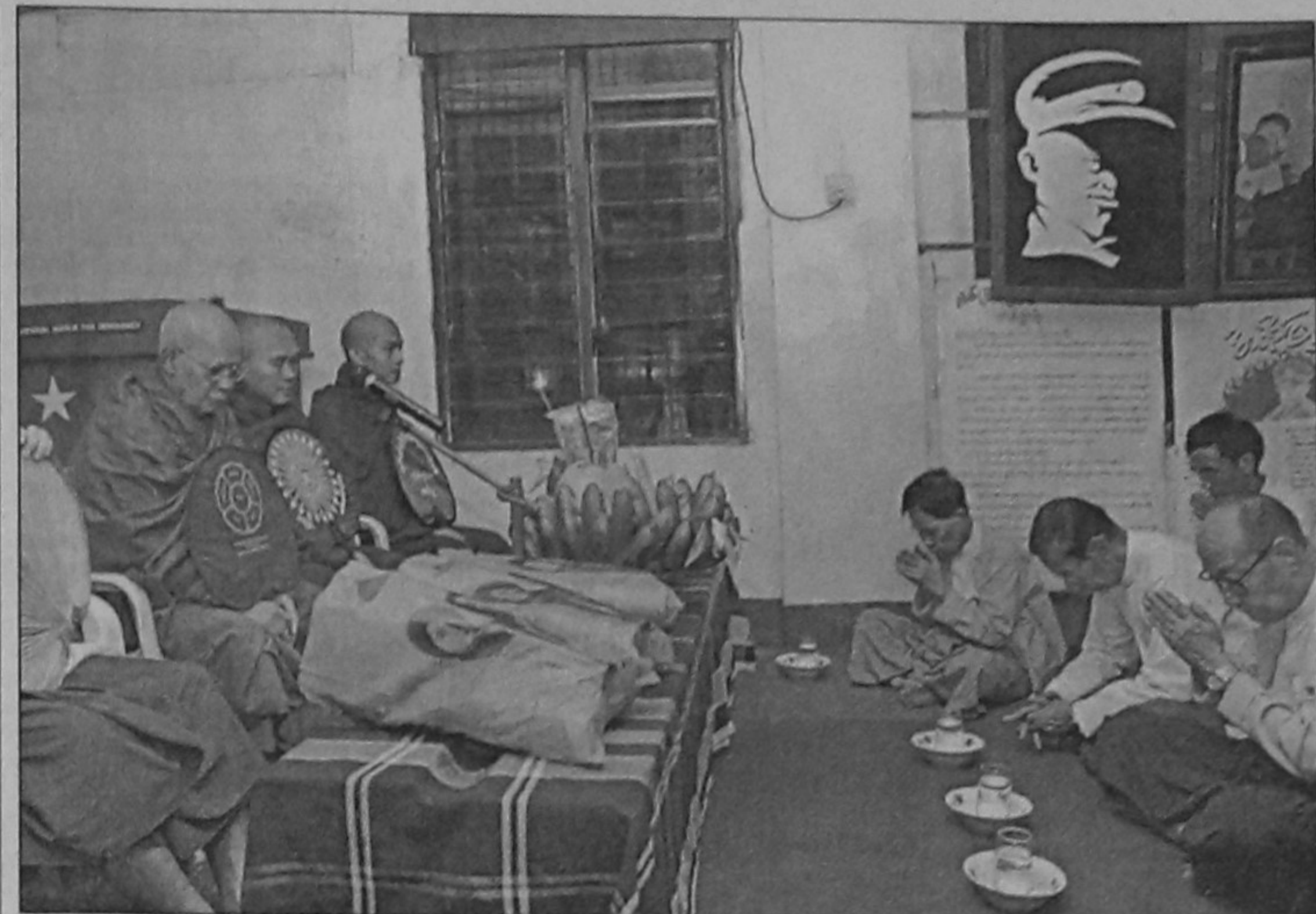
Supporters and members of Myanmar's detained Nobel Peace laureate Aung San Suu Kyi's party National League for Democracy (NLD) pray at the party headquarters in Yangon on Thursday. NLD members marked Buddhist New Year with a vow to continue their struggle for democracy in this military-run nation.

"We'll have to take them at their word, won't we," Information Minister Sherry Rehman said in an interview in Islamabad. She added that Washington's previous emphasis on ties to Musharraf and the Pakistani military "hasn't provided the results that were supposed to happen on the ground."