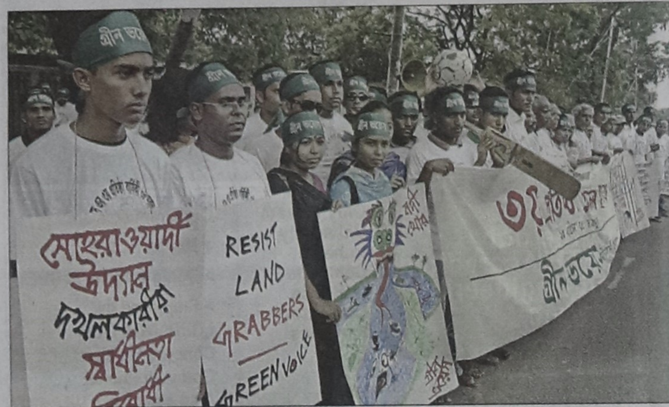
Green Voice forms a human chain at Shahbagh in the city yesterday on the occasion of its 3rd founding anniversary. They also demanded steps to free playgrounds from land-grabbers.