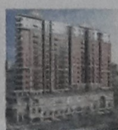
কনকর্ড প্রায় সড়িকার সিপাহি আবাসিক