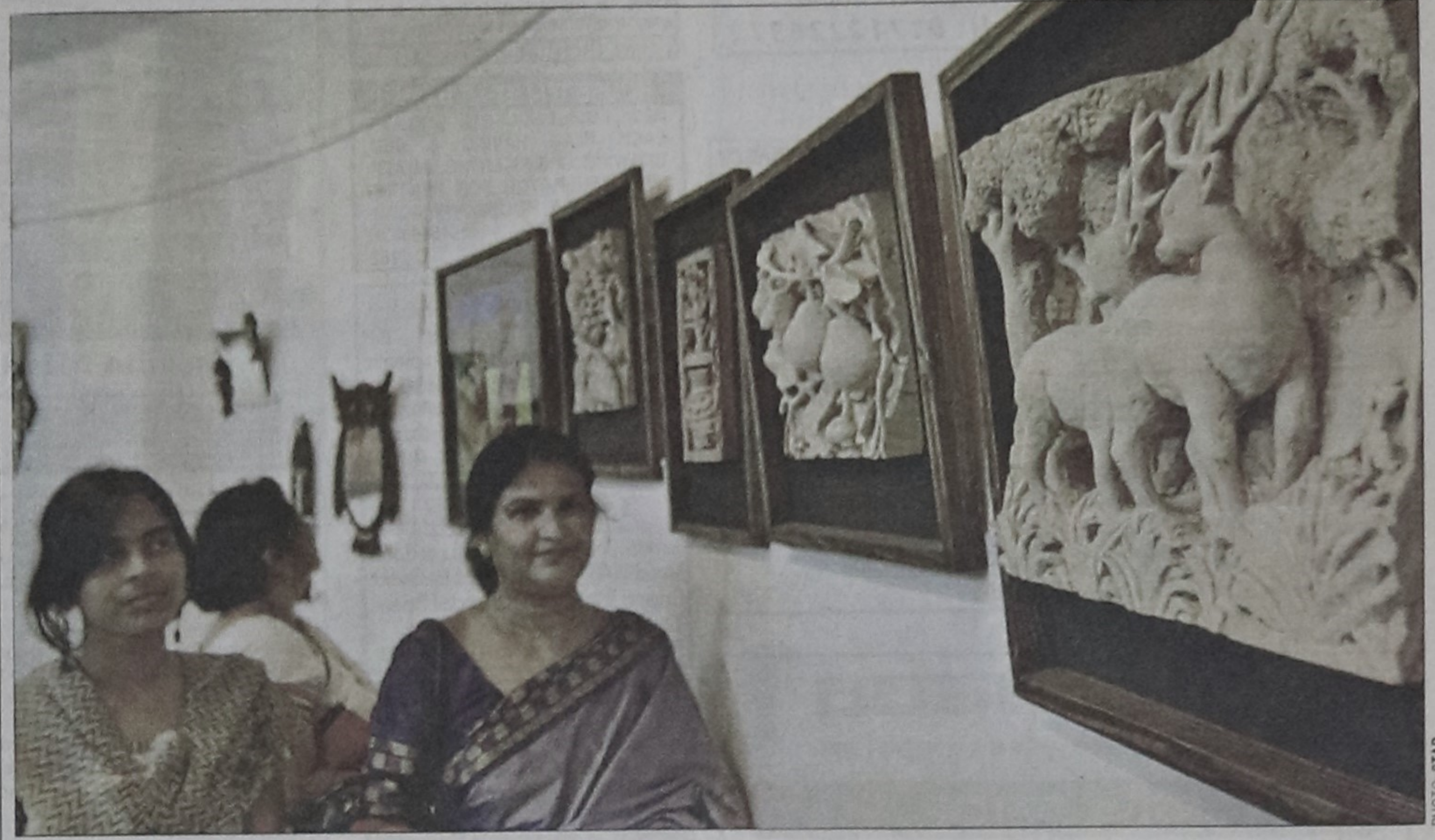
Visitors admire artworks at Zainul Abedin Gallery at the Institute of Fine Art of Dhaka University yesterday. Six students of the institute organised the seven-day exhibition.