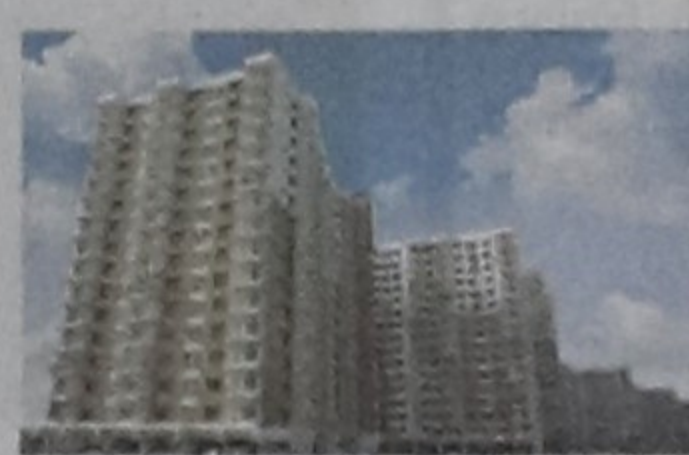
লেকসিটি কনকর্ড বিল্ডিং

কনকর্ড সেন্টার, ৪৩ উত্তর বাণিজ্যিক এলাকা, গুলশান-২, ঢাকা-১২১২