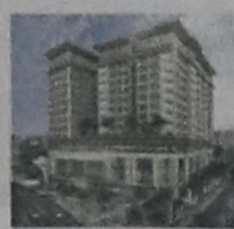
পুলিশ প্রাঙ্গণ কনকর্ড গুলশান

কনকর্ড প্রিন্স ১৪১৫ (১৬-৩০ এপ্রিল) কনকর্ড সেন্টার, গুলশান-২