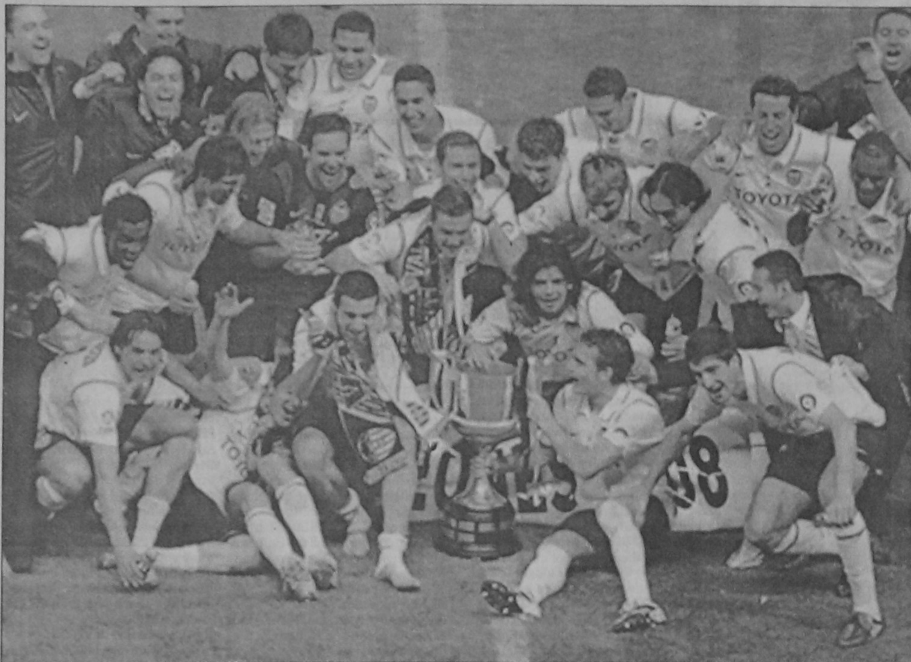
Valencia players celebrate with the trophy after beating Getafe 3-1 in the final to win the Copa del Rey at the Vicente Calderon Stadium in Madrid on Wednesday.