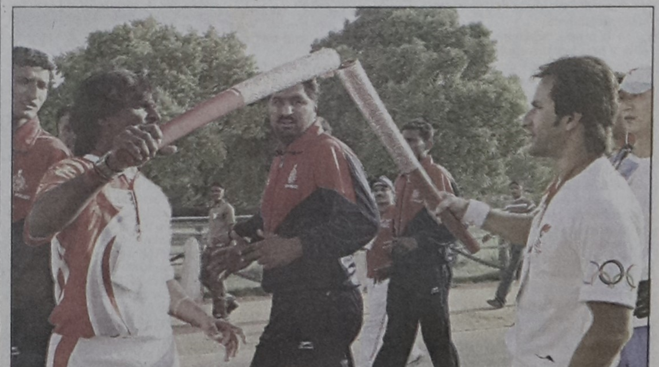
Indian hockey star Dhanraj Pillay (L) lights the Beijing Olympic torch from Bollywood star Saif Ali Khan during the torch relay in New Delhi on Thursday. Unfortunately for Bangladesh the torch relay is not coming here as the International Olympic Committee fixed its route on the basis of number of participants.