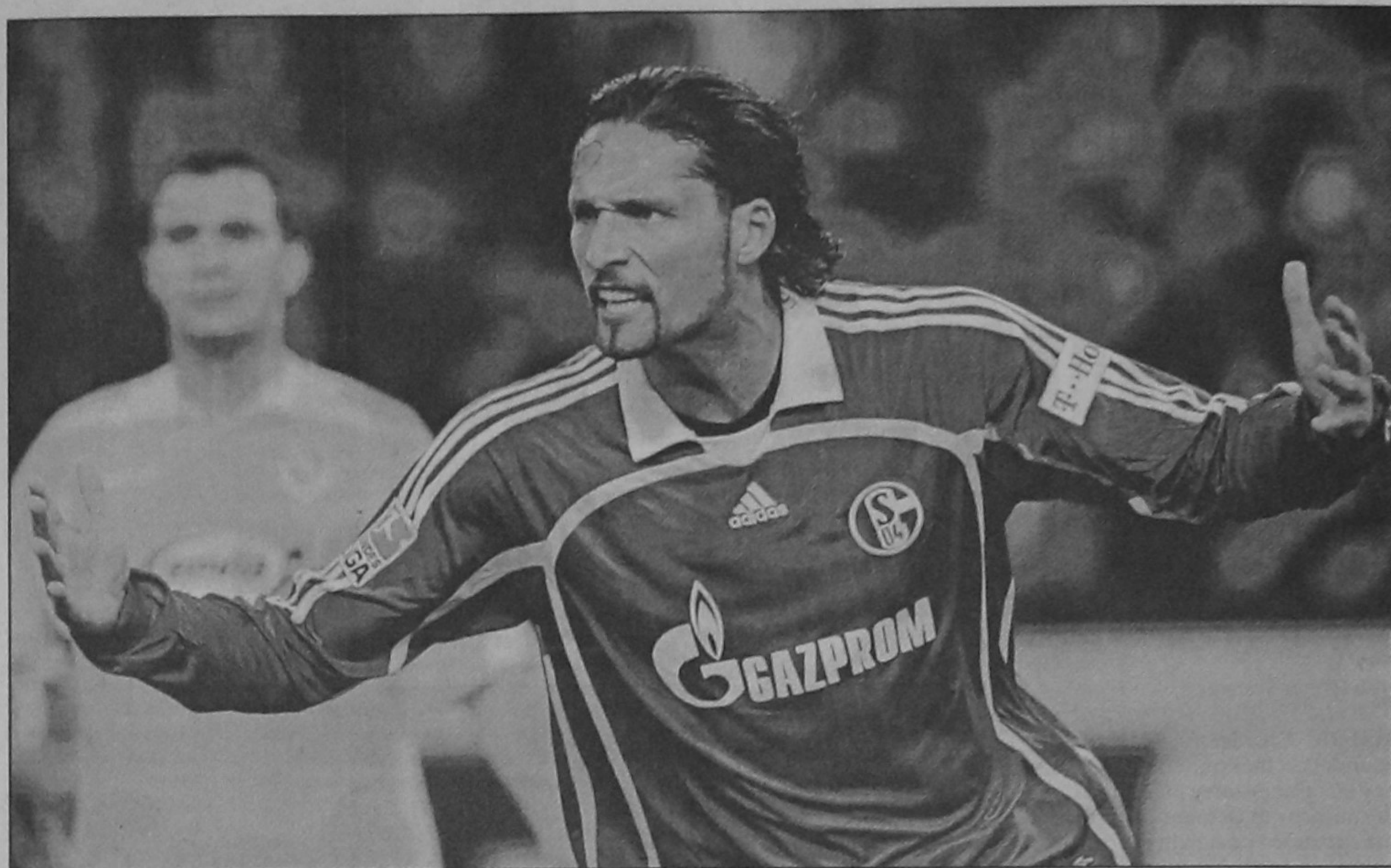
Schalke striker Kevin Kuranyi celebrates after scoring against Energie Cottbus during their Bundesliga match at the Veltins Arena Stadium in Gelsenkirchen on Tuesday.

"I get angry but I'm trying to accept it's a waste of energy to be furious because it is not worth it."