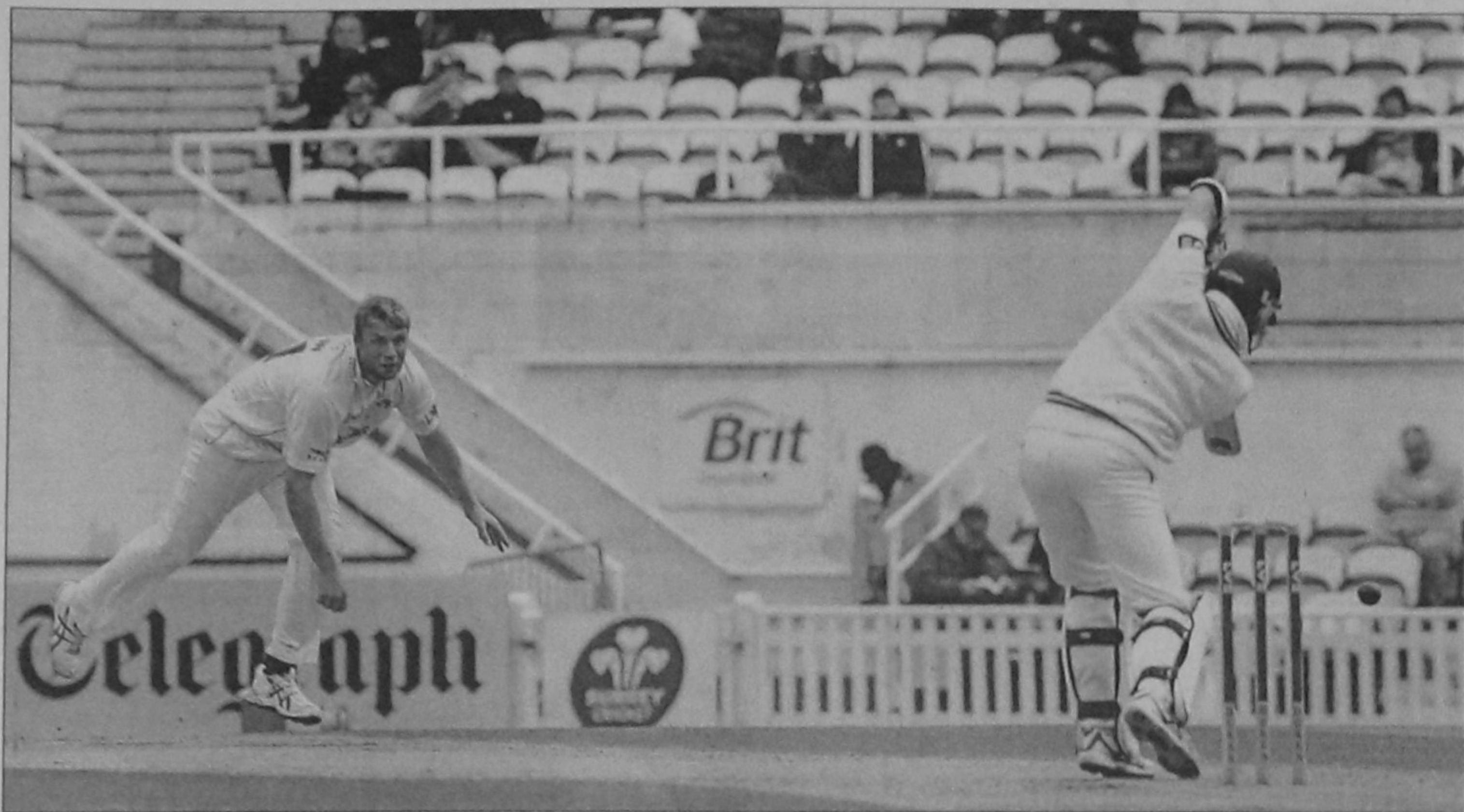
WELCOME BACK: England all-rounder Andrew Flintoff (L) follows through on a delivery during his comeback match for Lancashire against Surrey in their County Championship game at The Brit Oval in London yesterday.