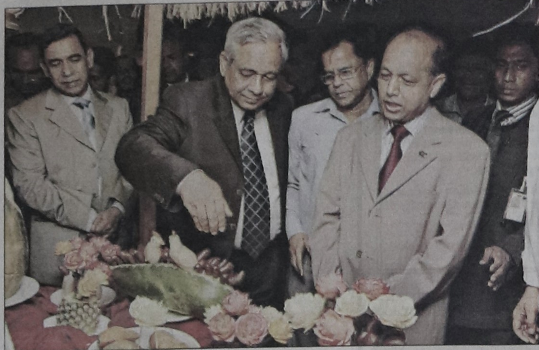
Agriculture Adviser CS Karim and Army chief General Moeen U Ahmed inaugurated a weeklong 'Potato Feast' at Radisson Water Garden Hotel in the city yesterday.

The acting AL chief also recalled the contribution of the civil and military officials, political leaders and freedom fighters, who struggled for the country's independence.