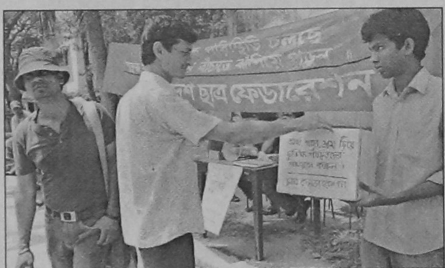
Members of Bangladesh Chhatra Federation collect money on Dhaka University campus yesterday to raise funds for the country's hunger-stricken people.