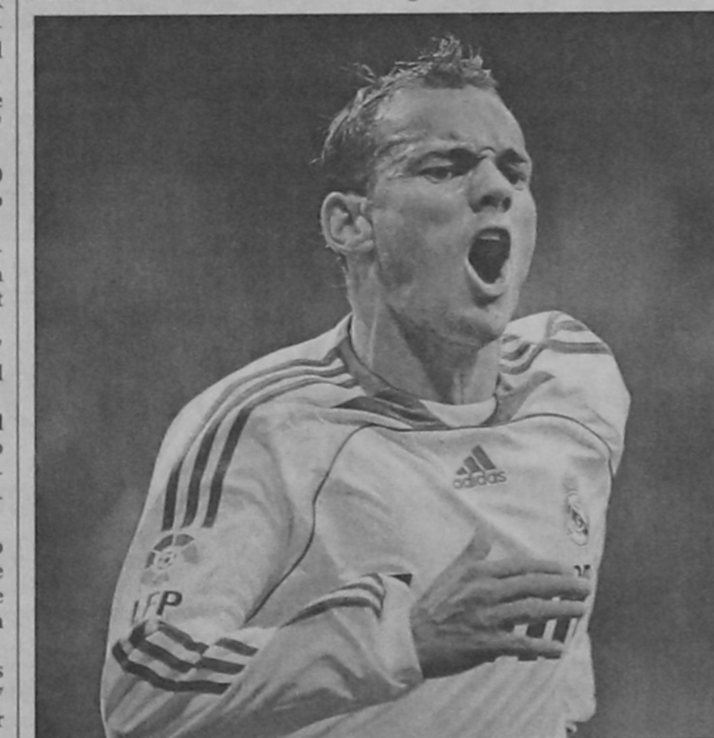
Real Madrid midfielder Wesley Sneijder celebrates after scoring the all-important goal against Murcia during their Primera Liga encounter at the Santiago Bernabeu on Sunday.

Real were jeered at half-time by their demanding home fans but winning is the most important thing and Sneijder's goal lifted the gloom.