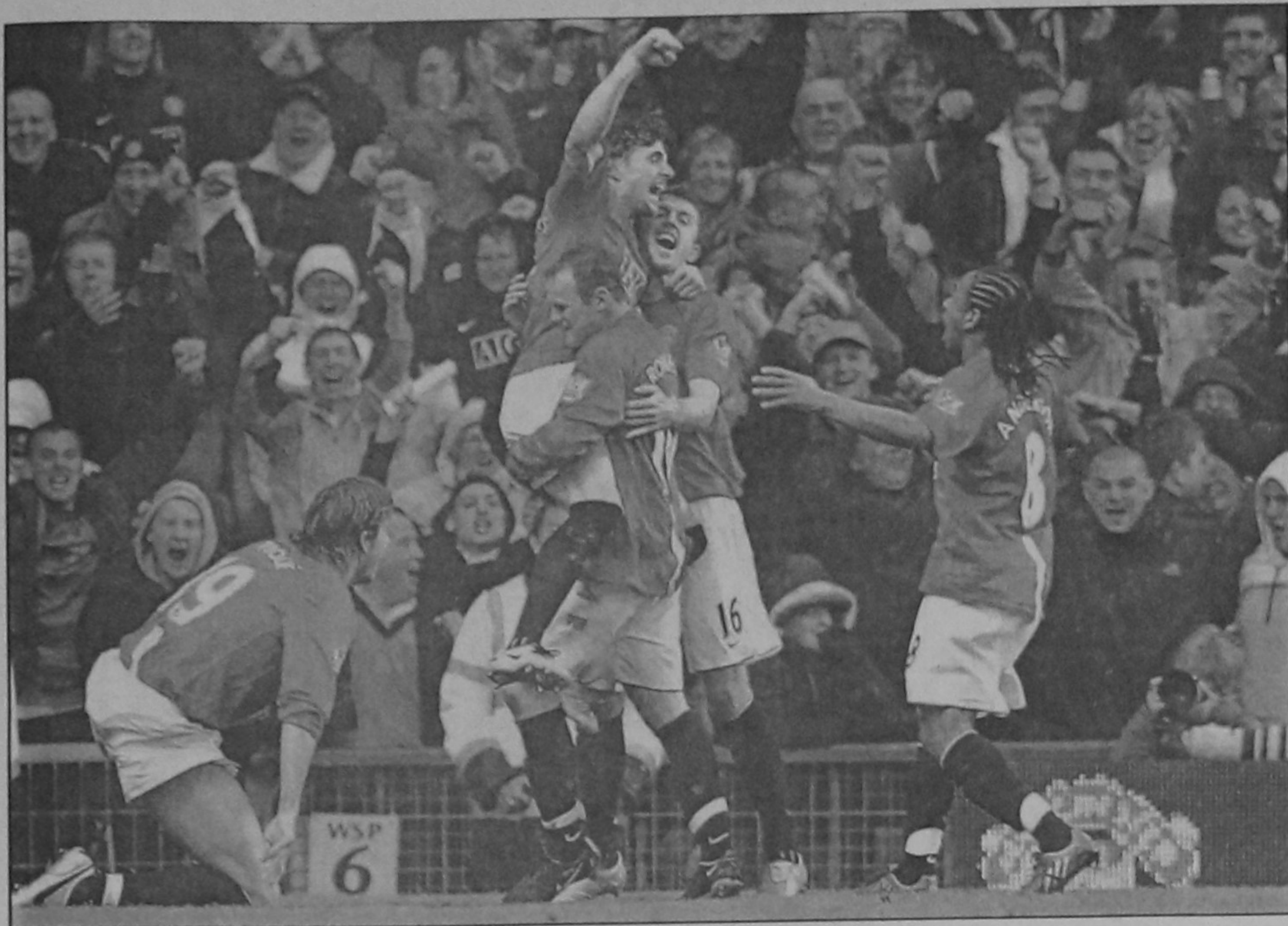
Manchester United midfielder Owen Hargreaves (top) is lifted by his ecstatic teammates after scoring the winning goal against Arsenal during their Premiership match at Old Trafford on Sunday.