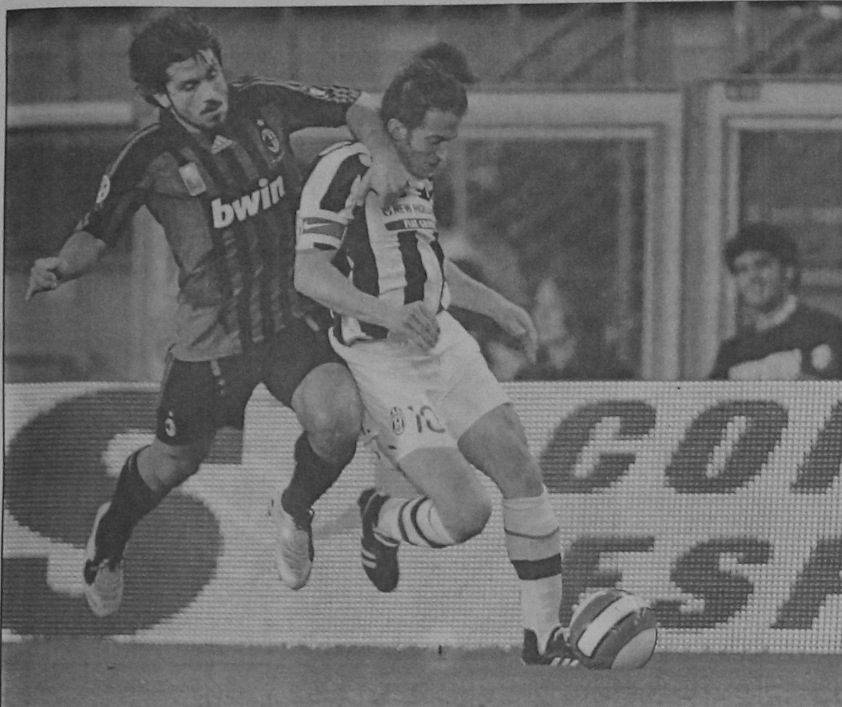
Juventus captain Alessandro Del Piero (R) is challenged by AC Milan midfielder Gennaro Gattuso during their Serie A encounter at the Olympic Stadium in Turin on Saturday.