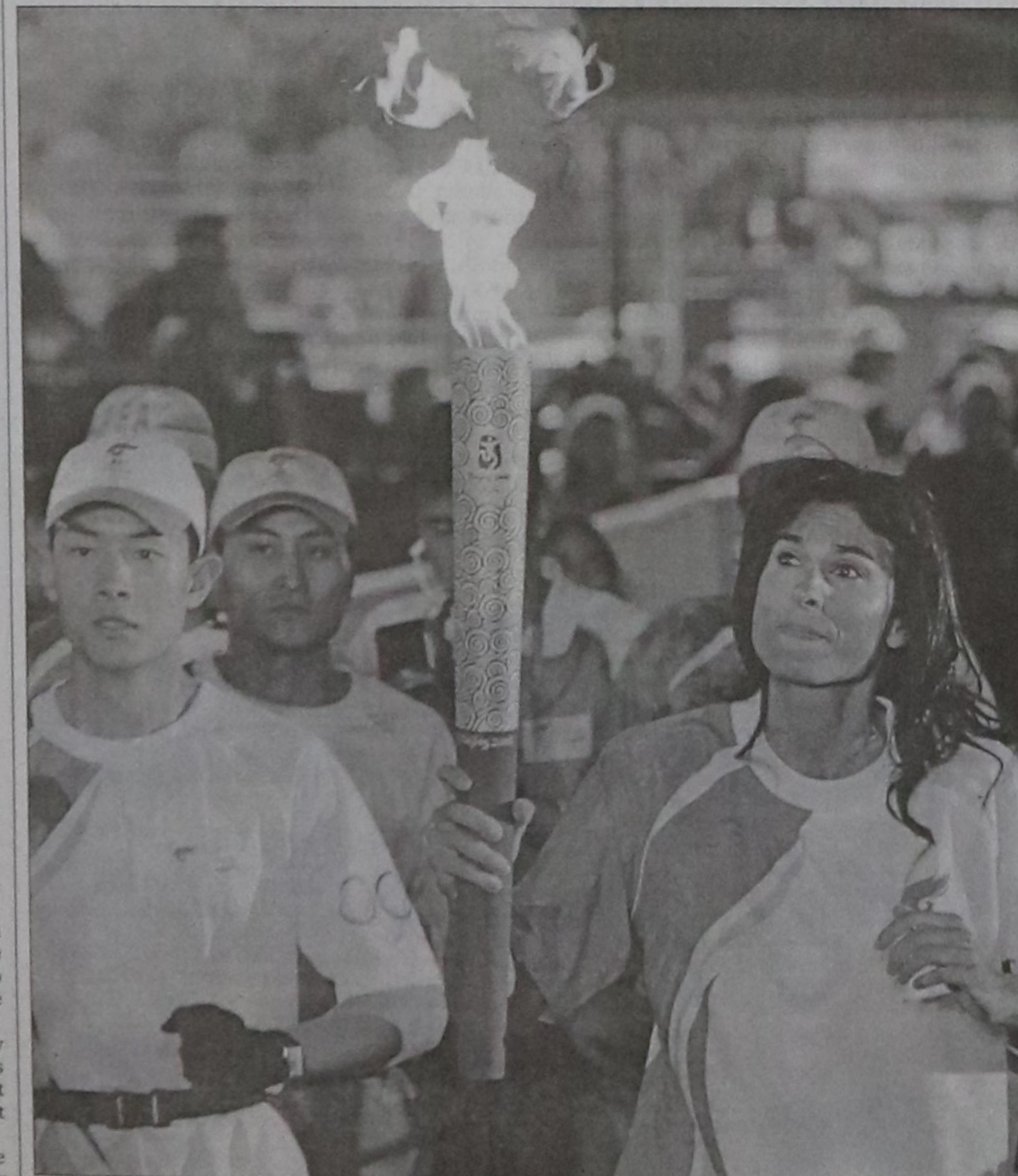
Argentina's former tennis star Gabriela Sabatini (R) carries the flame during the Beijing Olympic Torch relay in Buenos Aires on Friday.

"Either one is going to be tough," Sharapova said. "I'm just glad I gave myself another opportunity."