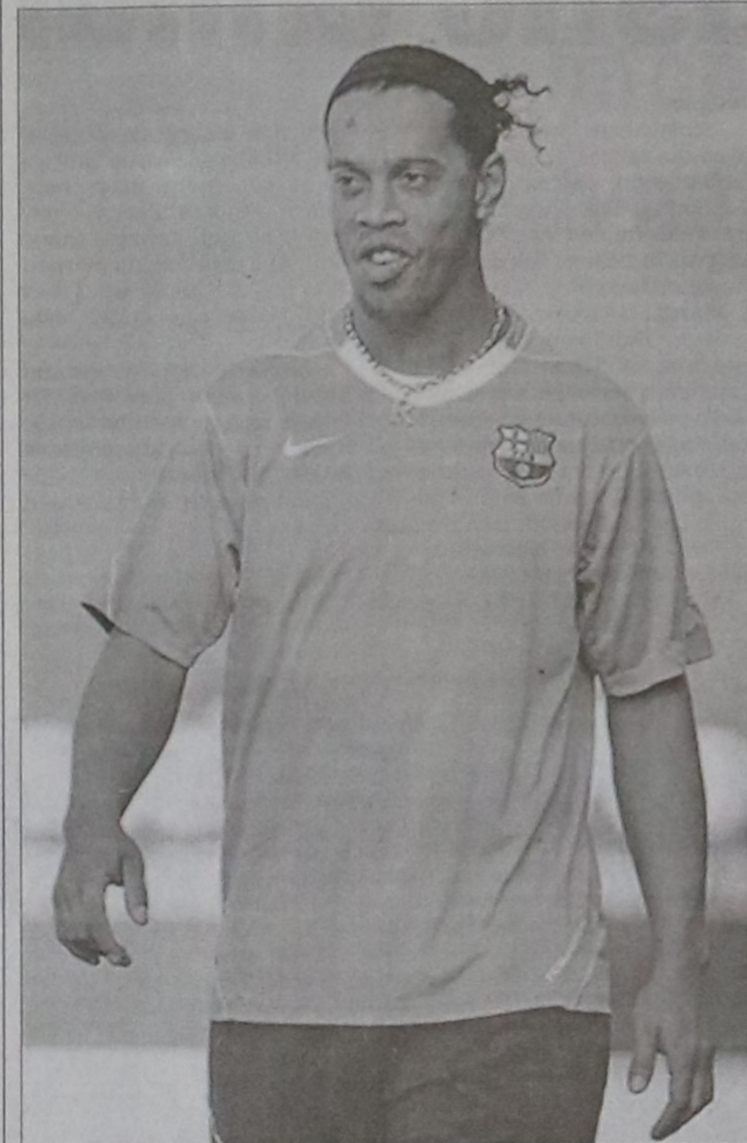
Barcelon star Ronaldinho is seen during practice in Barcelona on April 3, 2008.