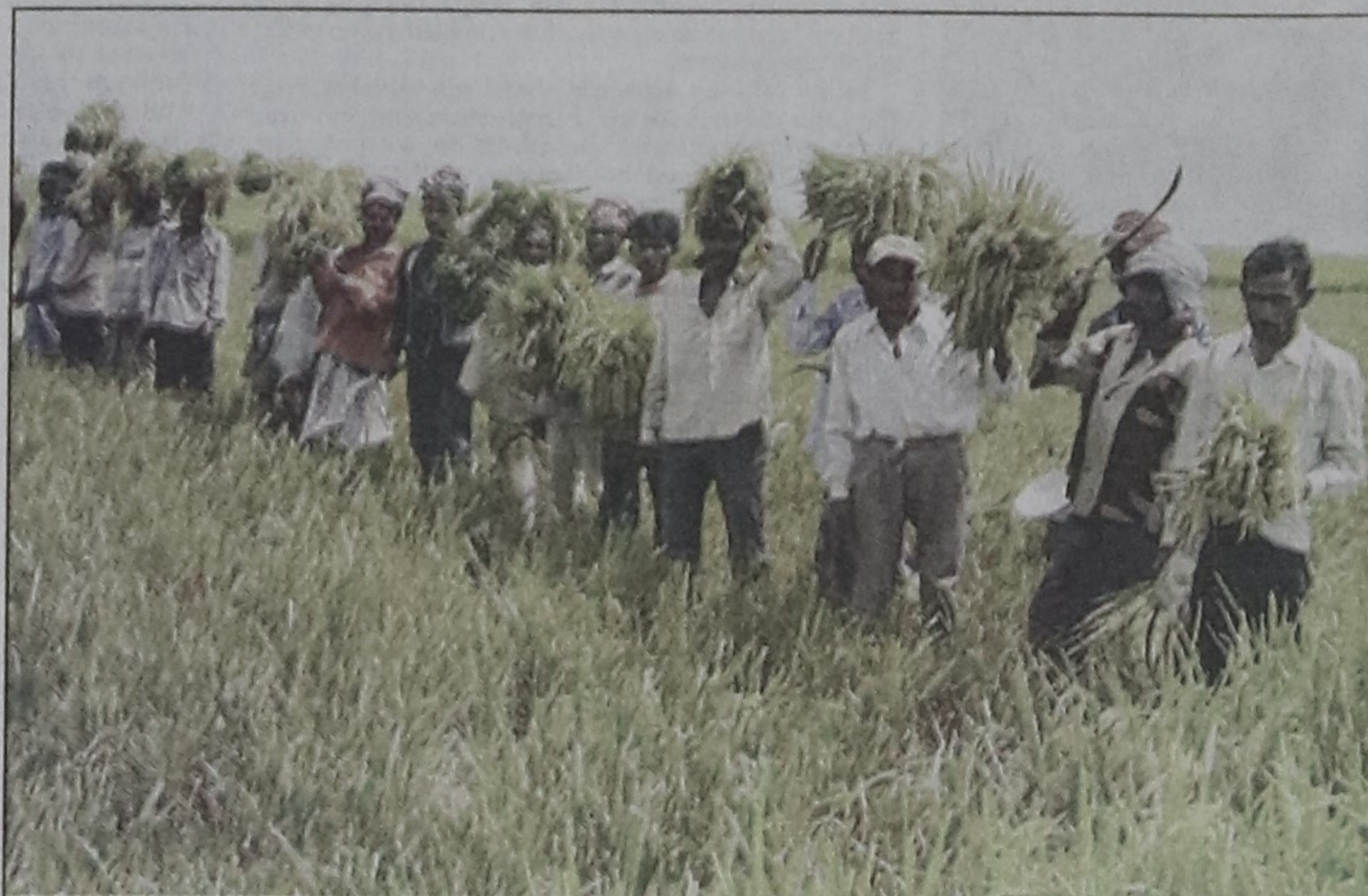
Mithamoin agriculture officials at a field on Thursday as farmers start harvesting Boro paddy.

Our Kishoreganj Correspondent reports: Boro harvest in the district started yesterday at Nallar Haor in Methamoin and some other haors at Itma and Austogram upazilas on