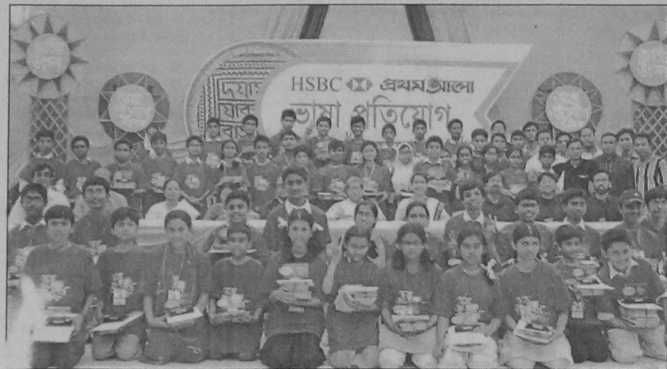
Winners of HSBC-Prothom Alo Language Competition pose for photo at the prize giving ceremony at Viqarunnisa Noon School and College yesterday.

The regular meeting of Rotary Club of Dhaka Central will be held. Venue: Dhaka Club. Time: 1:30pm.