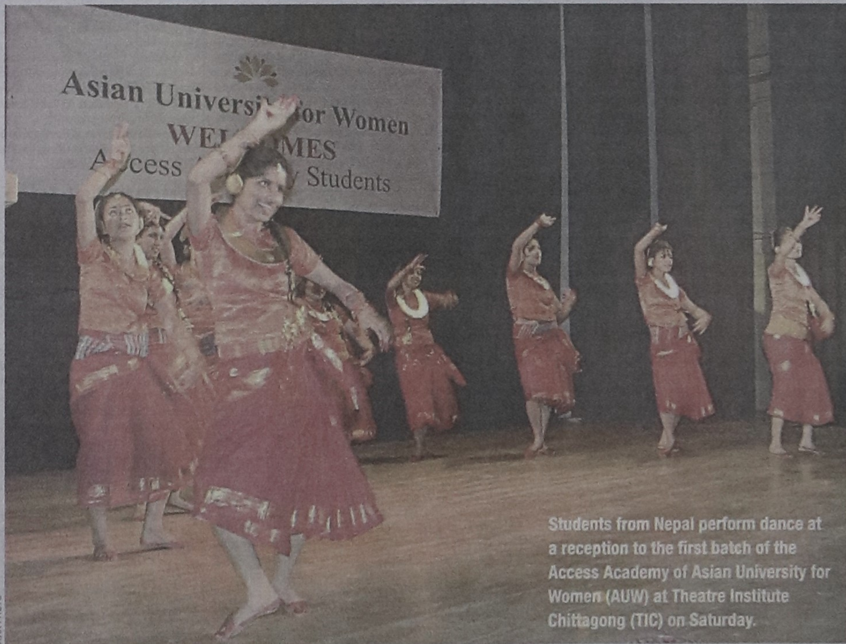
Students from Nepal perform dance at a reception to the first batch of the Access Academy of Asian University for Women (AUW) at Theatre Institute Chittagong (TIC) on Saturday.