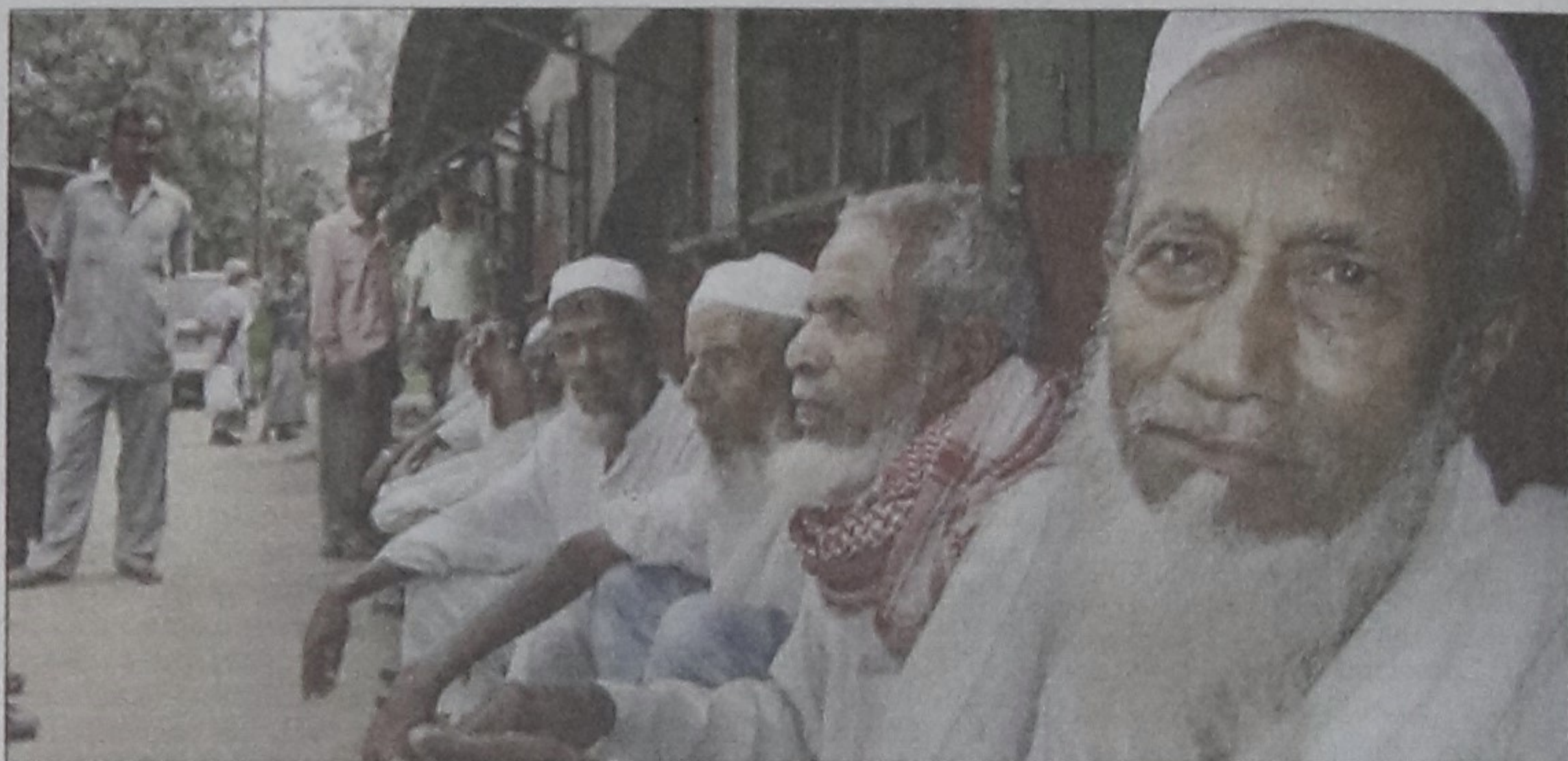
Elderly pensioners wait in queue for hours to draw pension in front of the Pay and Cash office of Bangladesh Railway in Chittagong.

With the waiting rooms outside the main building of Pay & Cash Office always remaining overcrowded, they wait for hours standing in a long queue in the open space being exposed to sun and rains, alleged some of the pensioners on the Pay and Cash Office premise on Sunday.