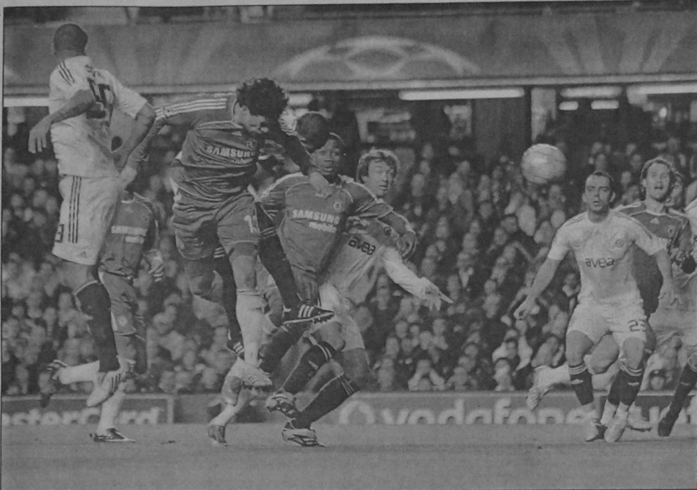
Chelsea's German midfielder Michael Ballack (2nd from L) glances a header to score the opening goal against Fenerbahce during their Champions League quarterfinal at Stamford Bridge on Tuesday.