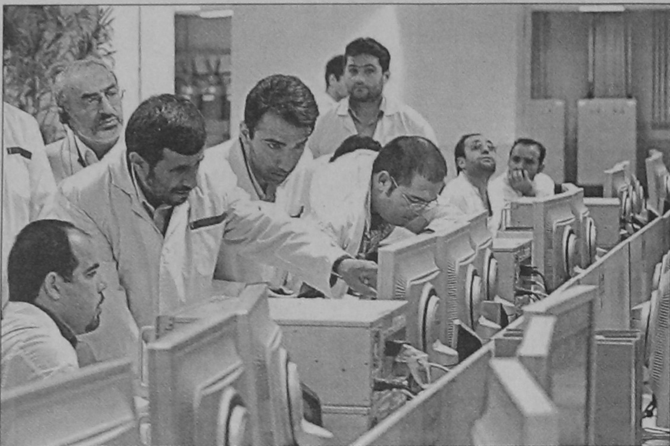
A handout picture shows Iranian President Mahmoud Ahmadinejad visits Natanz uranium enrichment facilities some 300km south of the capital Tehran Tuesday. Ahmadinejad announced Tuesday that Iran is starting work to install 6,000 new uranium-enriching centrifuges at its nuclear plant in Natanz.

In New Delhi, an Indian foreign ministry statement confirmed that "the External Affairs Minister will be visiting Islamabad on May 21 to hold a review meeting of the Composite Dialogue," but gave no further details.