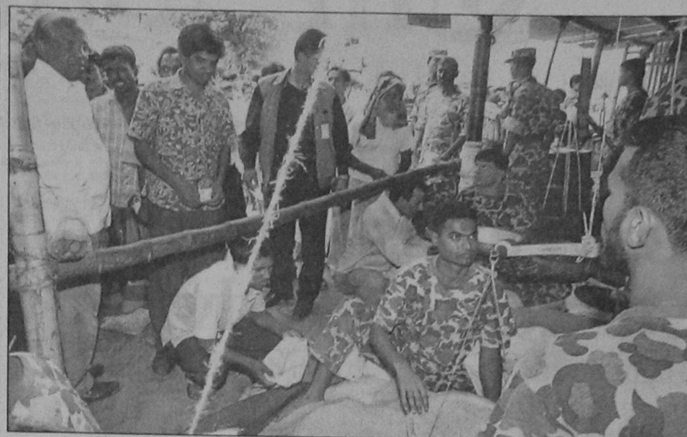
Chief Adviser Fakhruddin Ahmed visits BDR-run open market sale (OMS) centres at Mirpur, Agargaon and Pallabi in the city yesterday.

The Daily Star, Channel-i and local daily Azadi are the media partners of the fair, while Radio Today and bdjobs.com are radio and web partners.