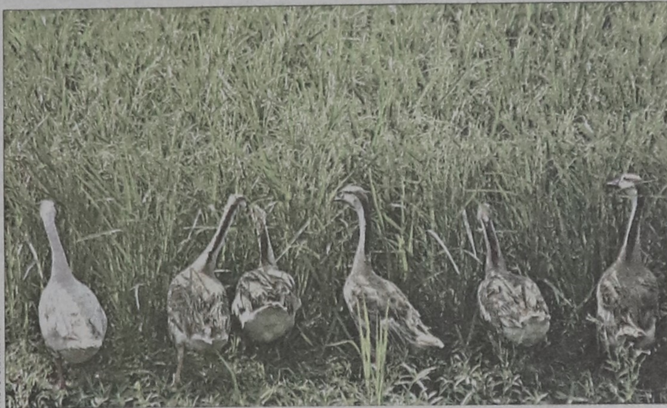
Swans frolic in a Boro field with rice plants bowing down by the weight of grains in Trimohoni under Demra near the capital. The nation awaits the much talked about bumper Boro harvest as the government struggles to rein in sky-rocketing prices of the staple.