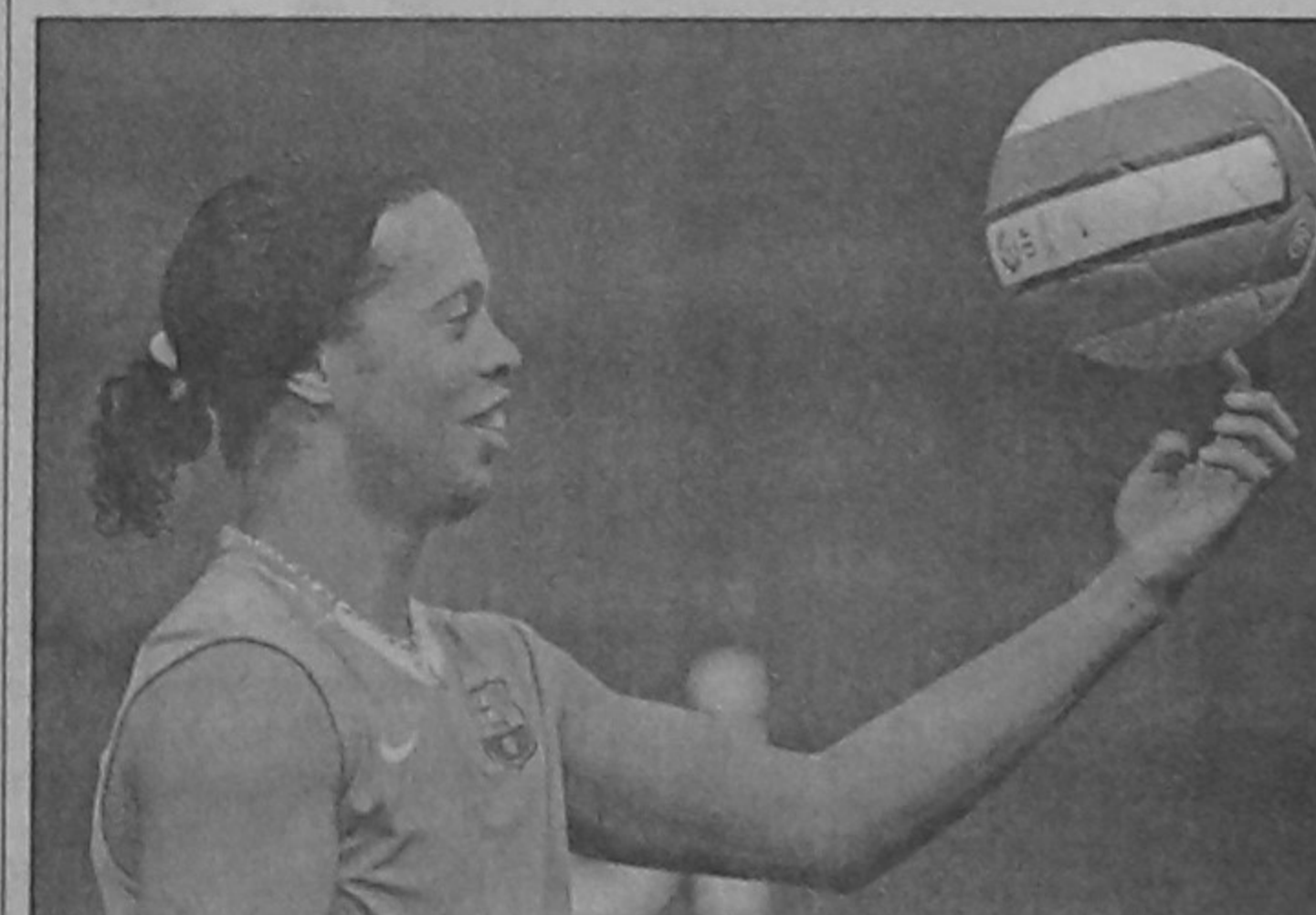
Barcelona star Ronaldinho spins the ball on his finger during a training session at the Nou Camp on Wednesday.

"Every day he is here working on his recovery and we can't ask anything more of him," Eto'o added.