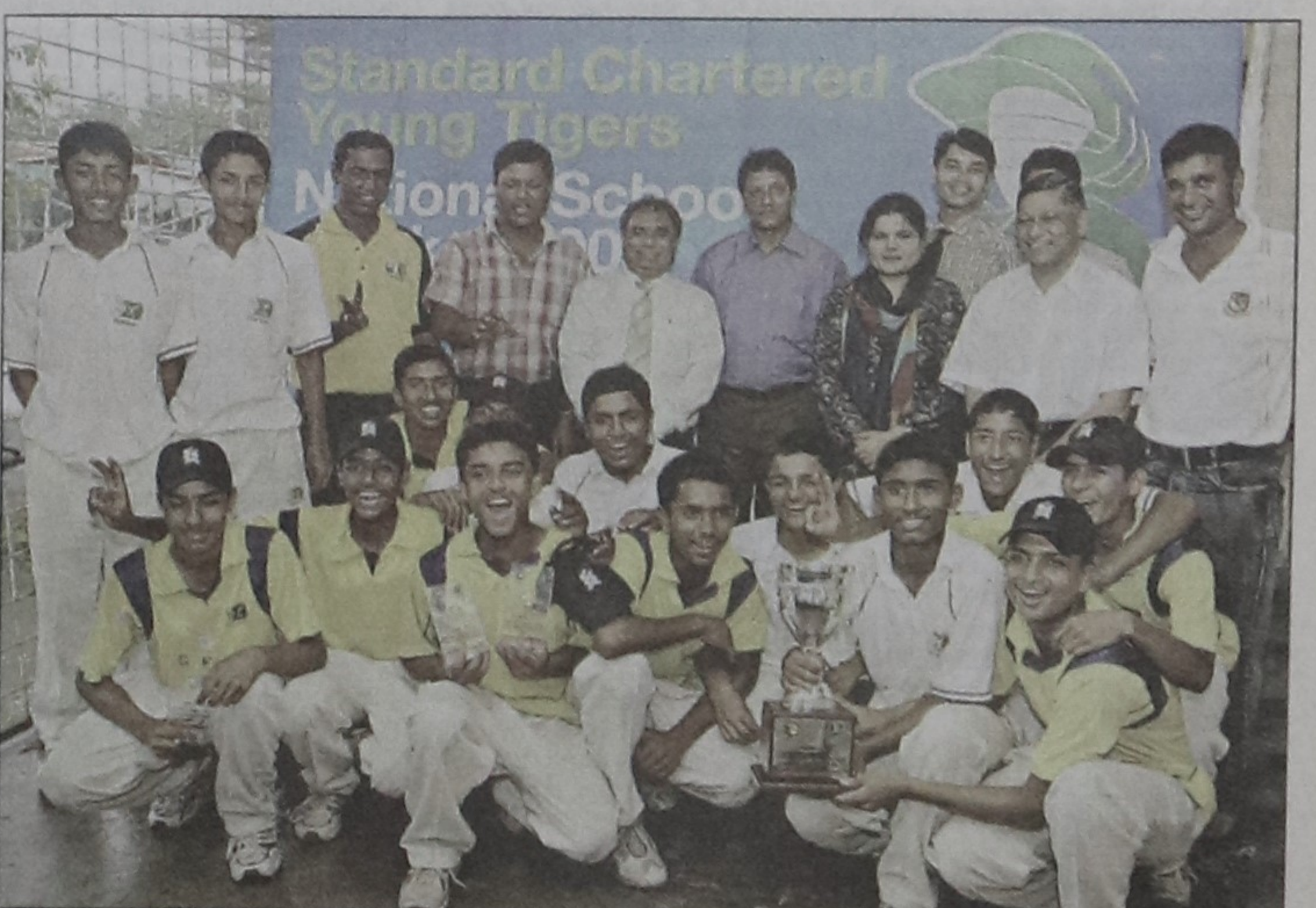
Players and officials of BKSP celebrate with the champions' trophy after they defeated Faridpur Zila School in the Standard Chartered Young Tigers National School Cricket final at the Dhanmondi Cricket Stadium yesterday.