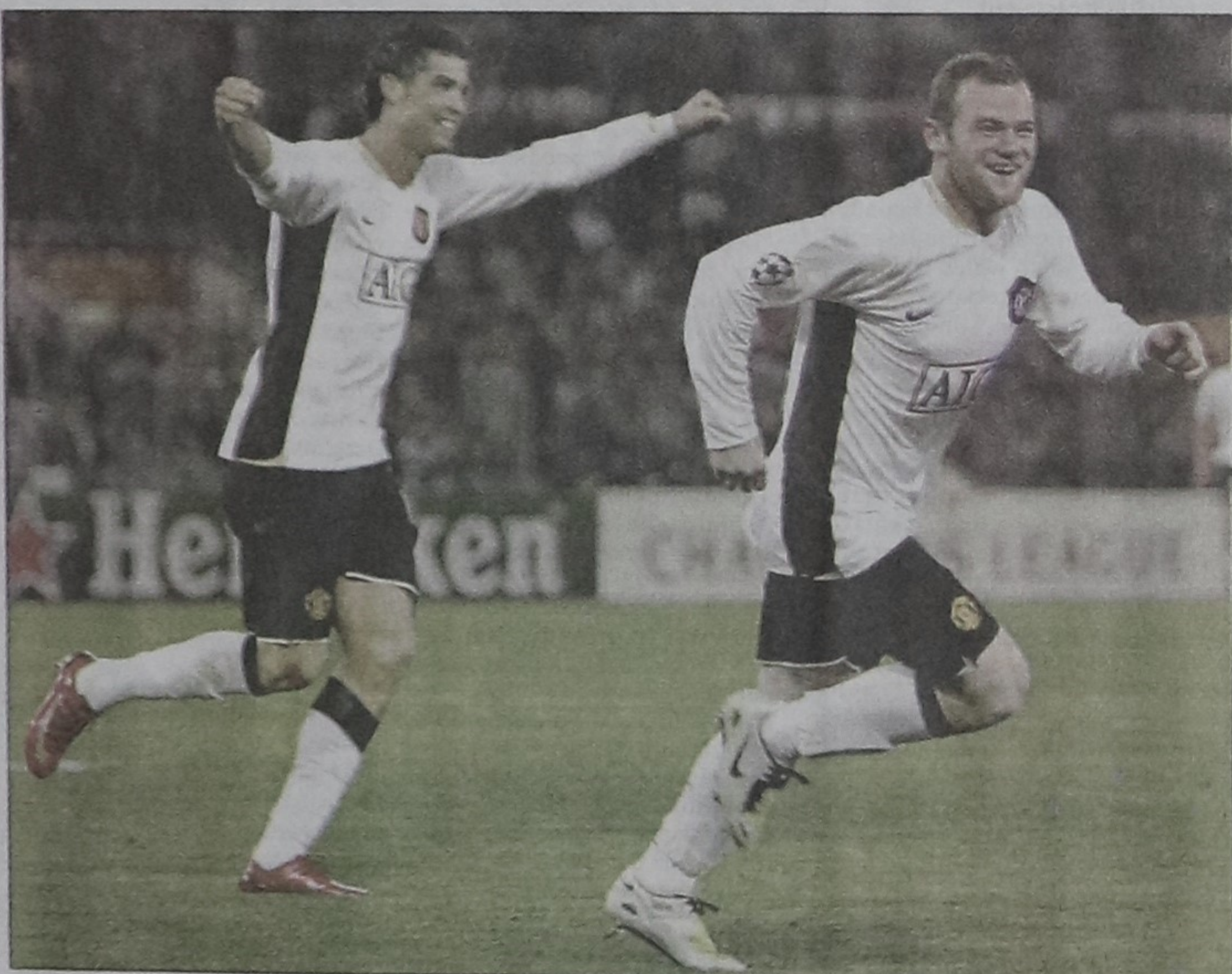
Manchester United stars Wayne Rooney (R) and Cristiano Ronaldo rejoice their second goal against Roma during the Champions League quarterfinal match at the Olympic Stadium in Rome on Tuesday.