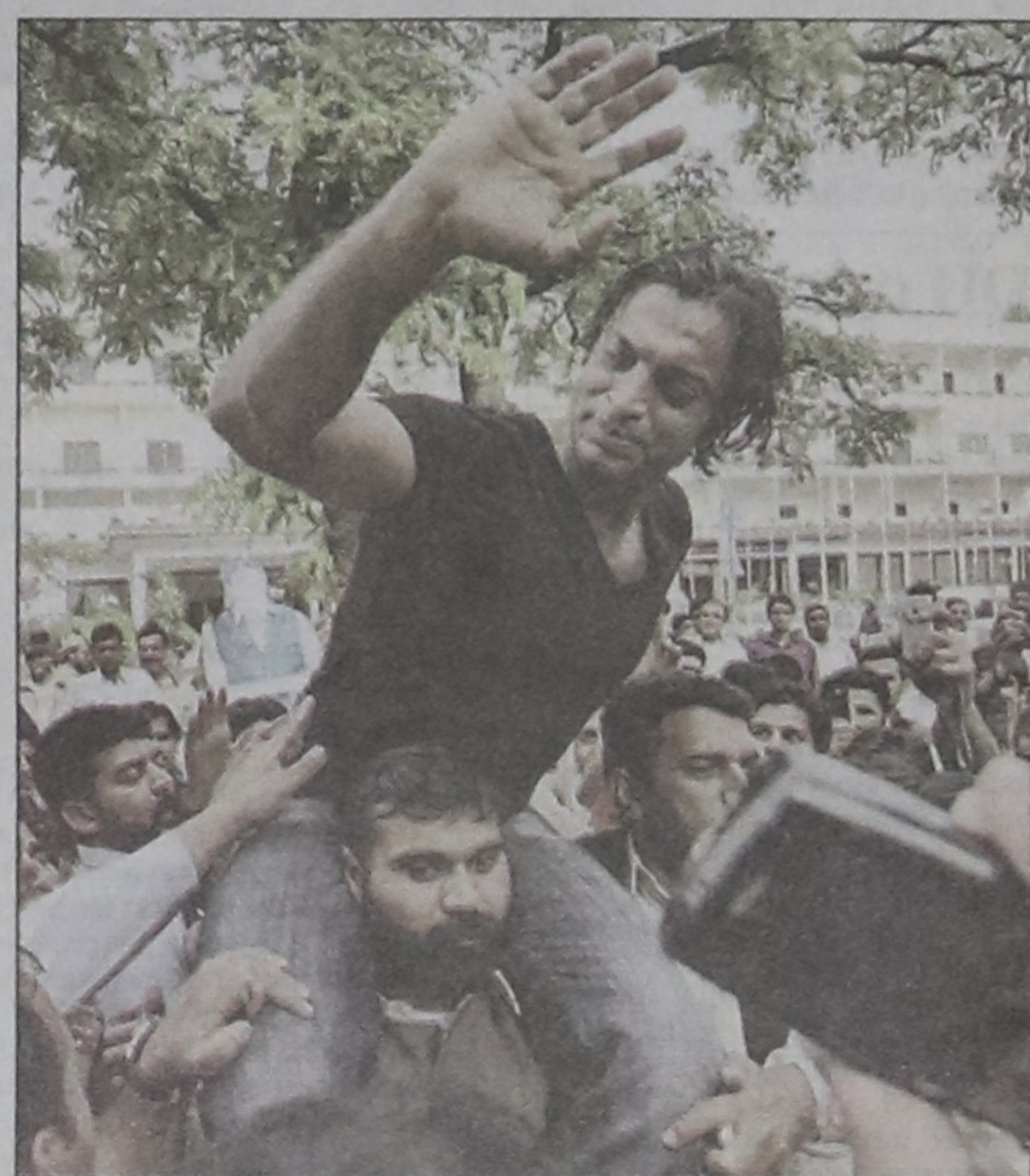
WE ARE WITH YOU: Supporters of banned Pakistan speedster Shoaib Akhtar (C) carry him on their shoulders as he waves after a press conference in Islamabad on Wednesday.