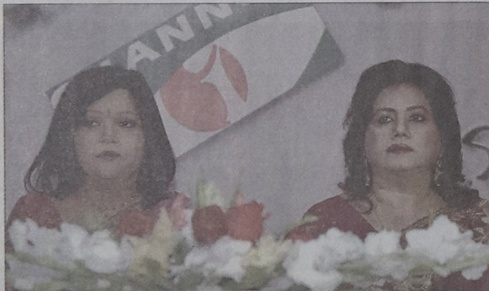
Noted singers Sabina Yasmin and Runa Laila will select the winner of Channel i Shera Kantho in the final round

Media personality Afzal Hossain is the project director of Channel i Shera Kantho .