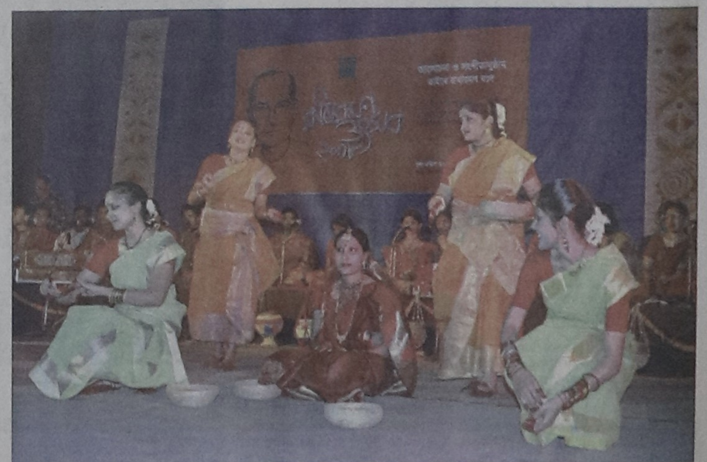
Artistes perform Dhamail dance at the programme

Artists of the two organisations also performed Dhamail dance.