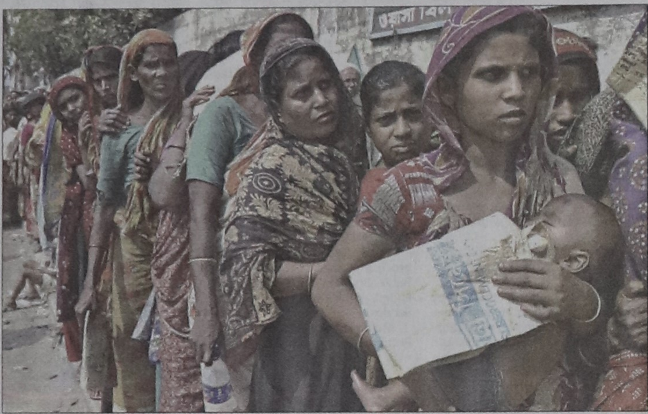
A young mother with her five-month-old baby waits in queue along with many others to buy rice at subsidised rate from a BDR shop near Mirpur Bangla College at yesterday morning.