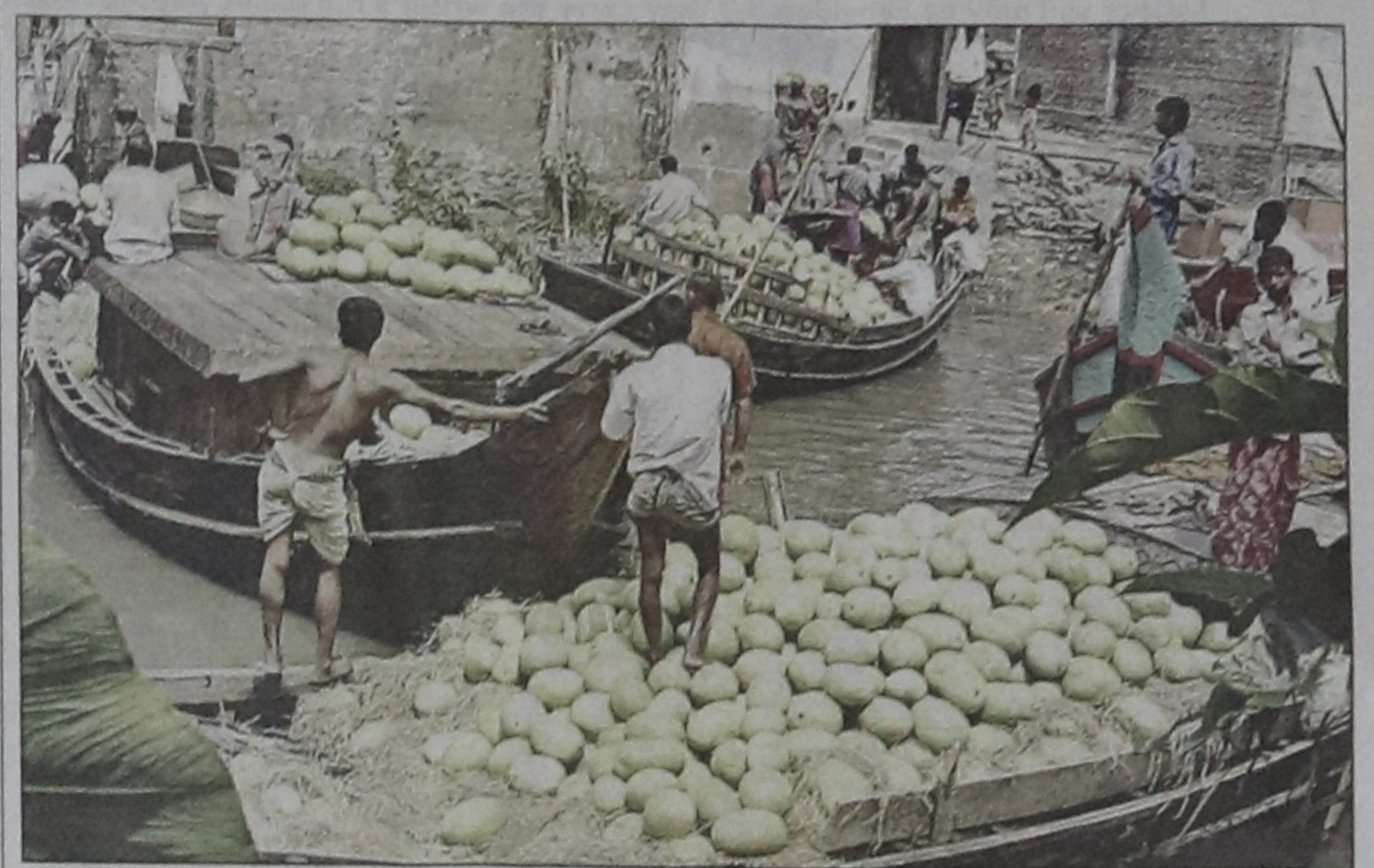
Boatloads of watermelon arrive in Barisal port but the juicy summer fruit remains dear to most people.