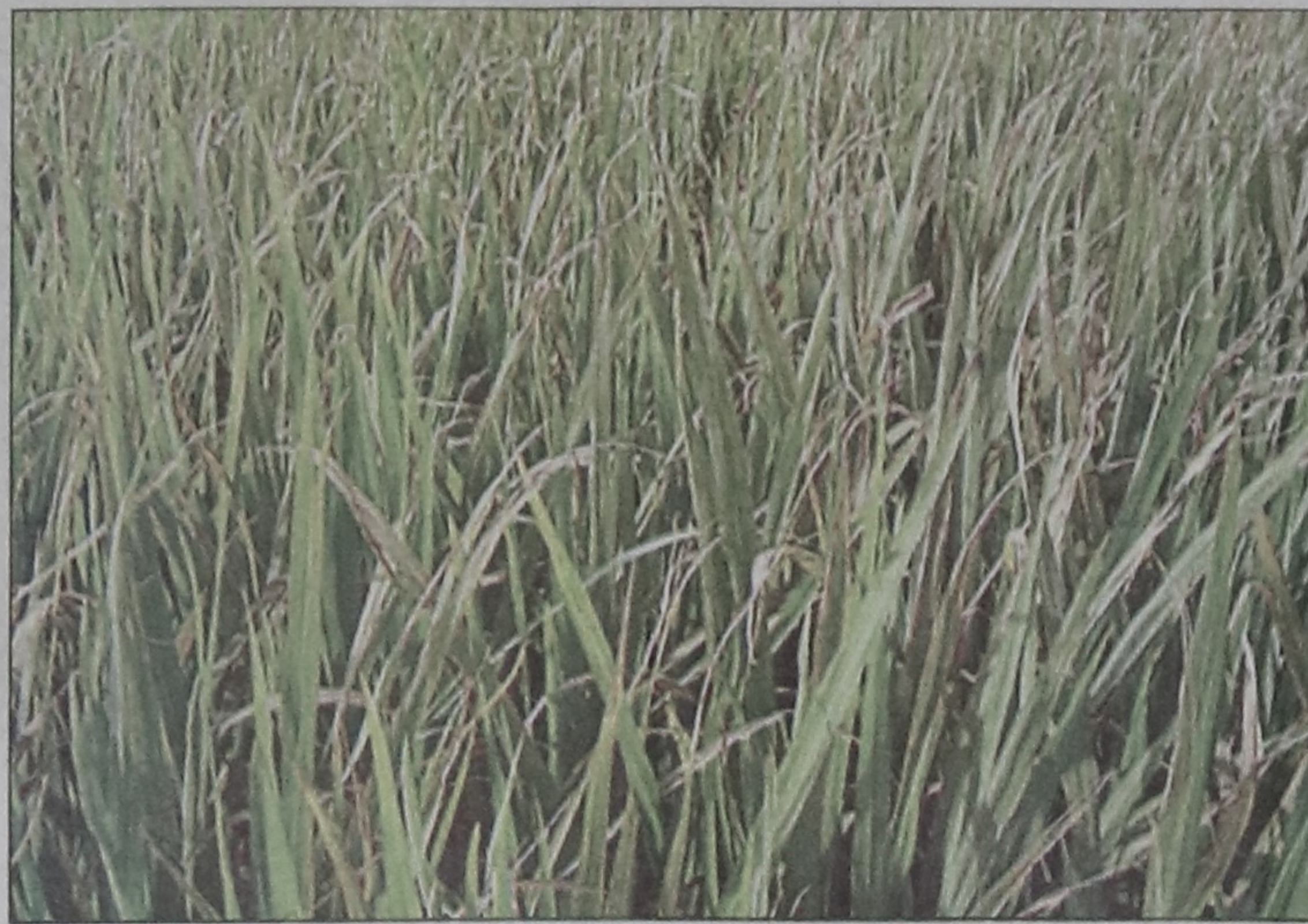
A Boro field in Khulna attacked with BLB disease.