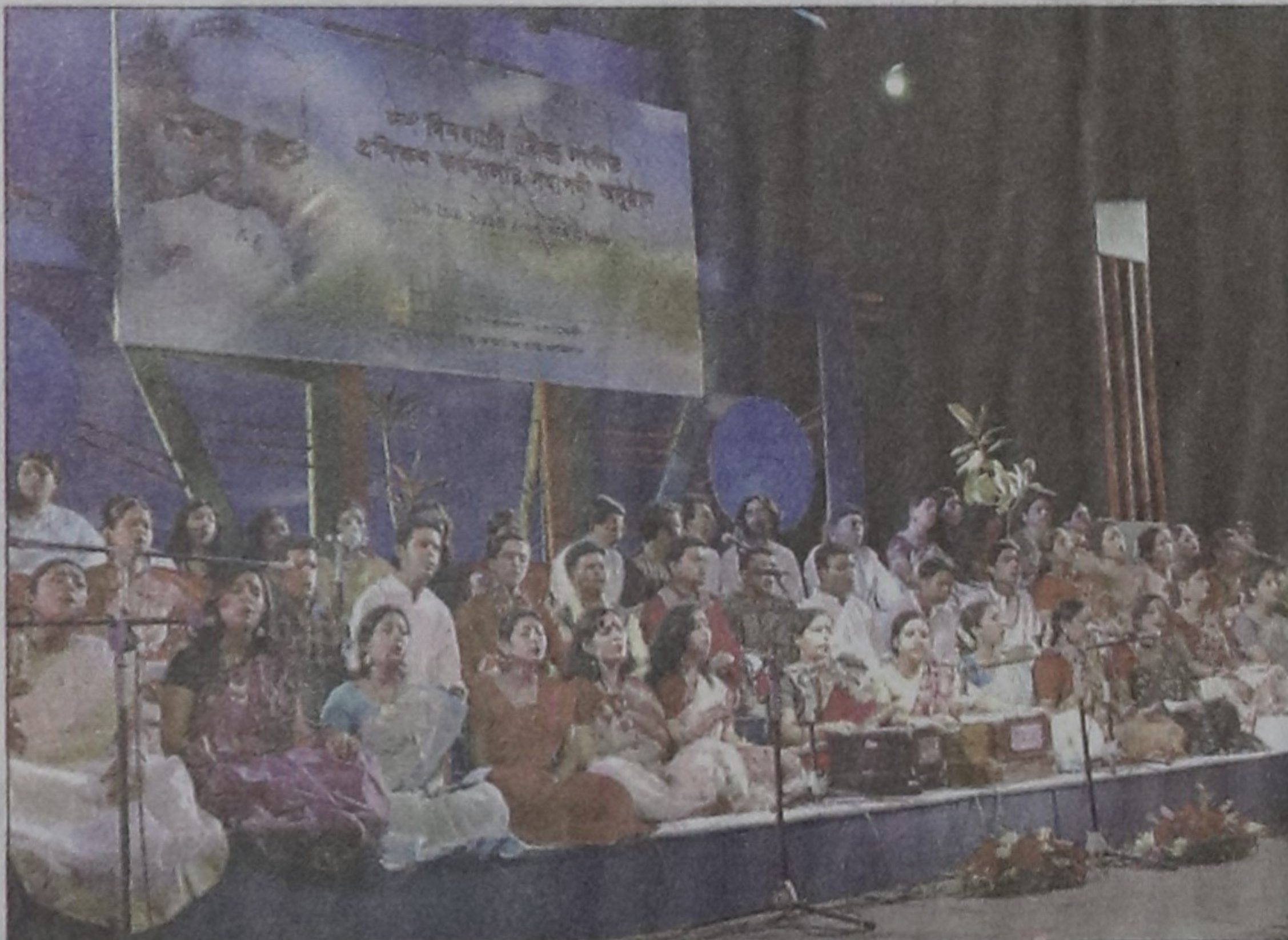
Participants of the workshop perform at the closing ceremony

Discussions provided an overview on Tagore's mastery as a lyricist and composer. They also