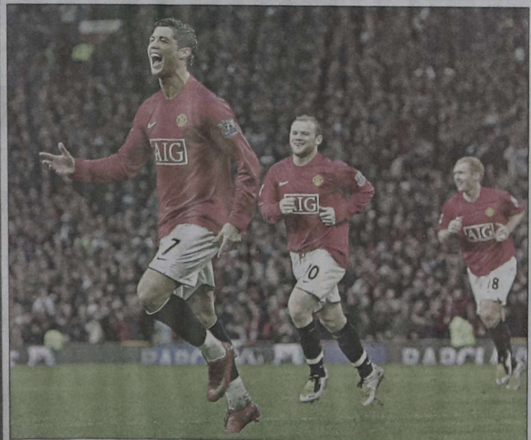
FOLLOW ME: Manchester United's Portuguese midfielder-turned-goalmachine Cristiano Ronaldo (L) celebrates after scoring his side's opening goal against Aston Vila during their Premiership match at Old Trafford on Saturday. It was Ronaldo's 35th goal of the season.

The prolific Indian is already the top one-day batsman with 16,361 runs and holds the world record of 39 Test and 42 one-day centuries.