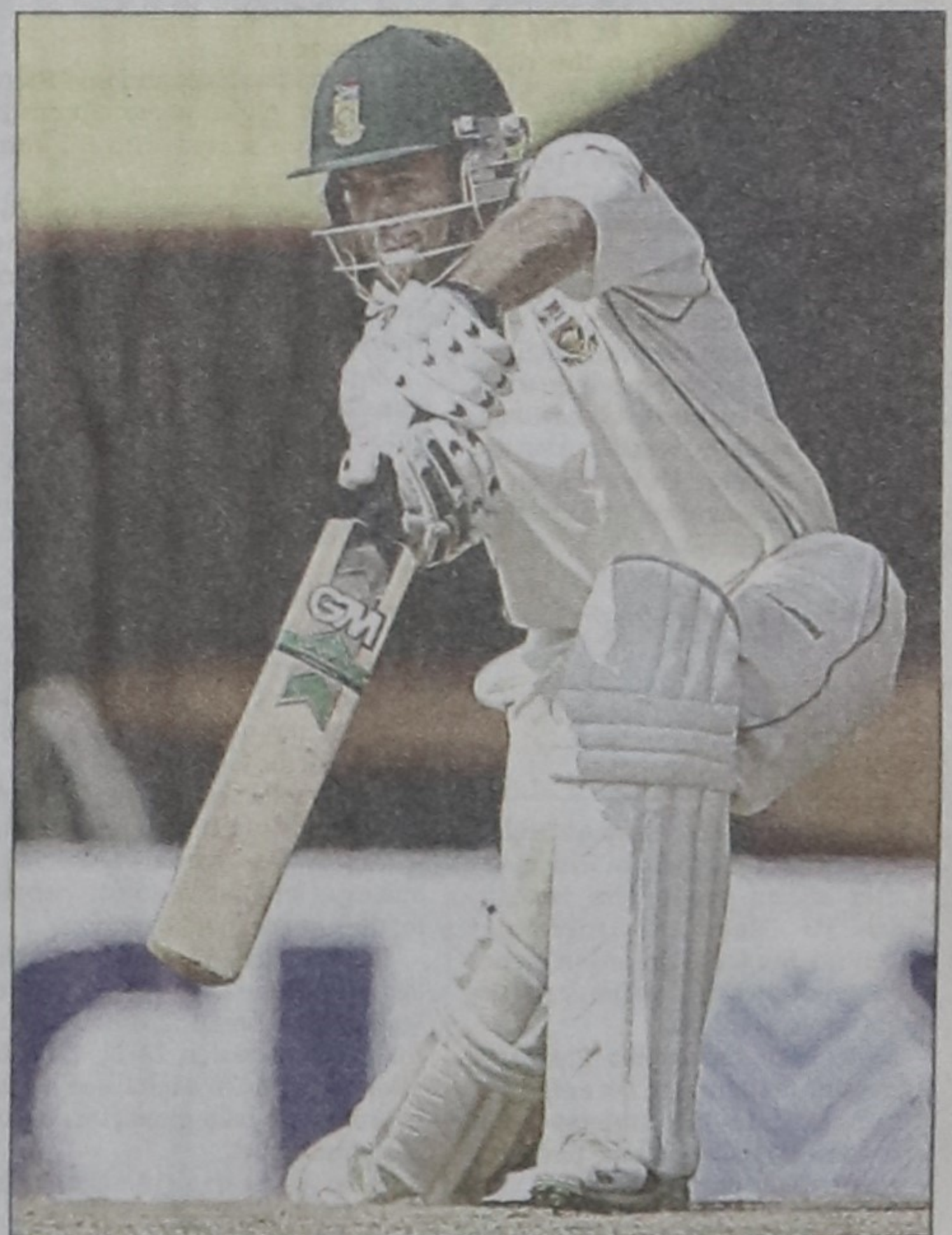
TOO GOOD FOR BATTING: South Africa opener Neil McKenzie off-drives the ball during his unbeaten knock of 155 against India on the fifth and final day of the first Test at the MA Chidambaram Stadium in Chennai yesterday. The match produced a staggering 1498 runs in three innings including a magnificent 319 by Indian opener Virender Sehwag.

Final scoreboard of the first Test SEE PAGE 18 COL 5