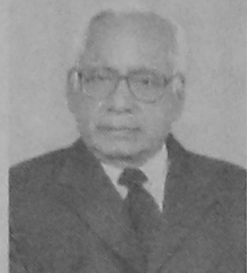
Professor Dr. Iajuddin Ahmed