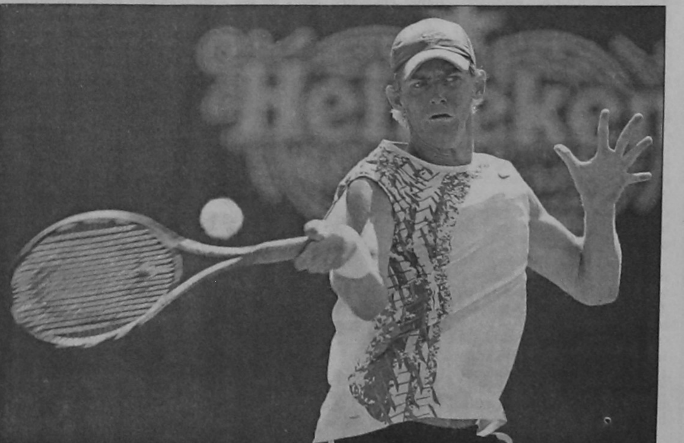
South African Kevin Anderson makes a forehand return against Serbian Novak Djokovic during the Sony Ericsson Open at Florida on Friday.