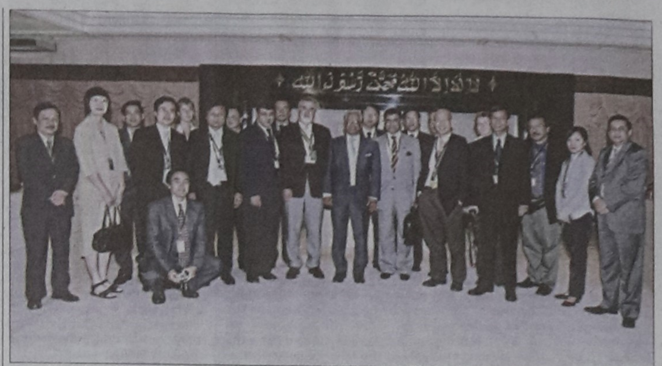
Members and officials of the Asia News Network call on Chief Adviser to the Caretaker Government Fakhruddin Ahmed at his office yesterday.