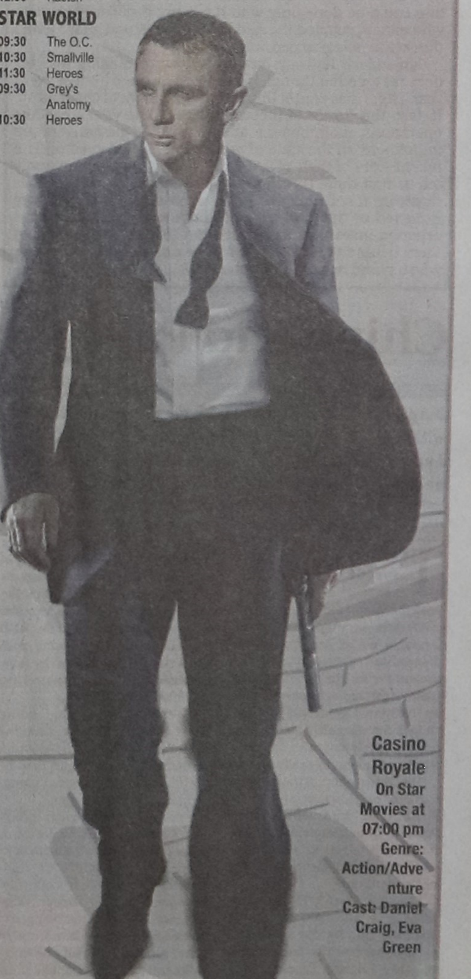
Casino Royale On Star Movies at 07:00 pm Genre: Action/Adventure Cast: Daniel Craig, Eva Green

12:30 Amader Otthi 02:00 Daily Soap: Mohanagar 02:40 Drama Serial: Shomo Kutir 03:05 Nodi O Jibon 04:20 Drama Serial: Pingol Akash 05:30 Raat- Biraatey 06:05 Citycell Din-er Sheshey 06:50 Sports Vision 08:25 Drama: Mohanagar 09:05 Apan Agami 09:45 Drama Serial: Swapnochura 11:25 Drama Serial: Shohor-er Shesh Bari 12:00 Shingbad Protidin NATIONAL GEOGRAPHIC CHANNEL 08:30 Big Bang 09:00 Nurse Sharks 09:30 Sauna Belt 10:00 Glacier Bay 11:30 Lufthansa Nat Geo Genius 12:00 Journey of Discovery 12:30 Dipo Death Trap 01:30 The Most Dangerous Drug 02:30 Golden Seals 03:30 Rhino