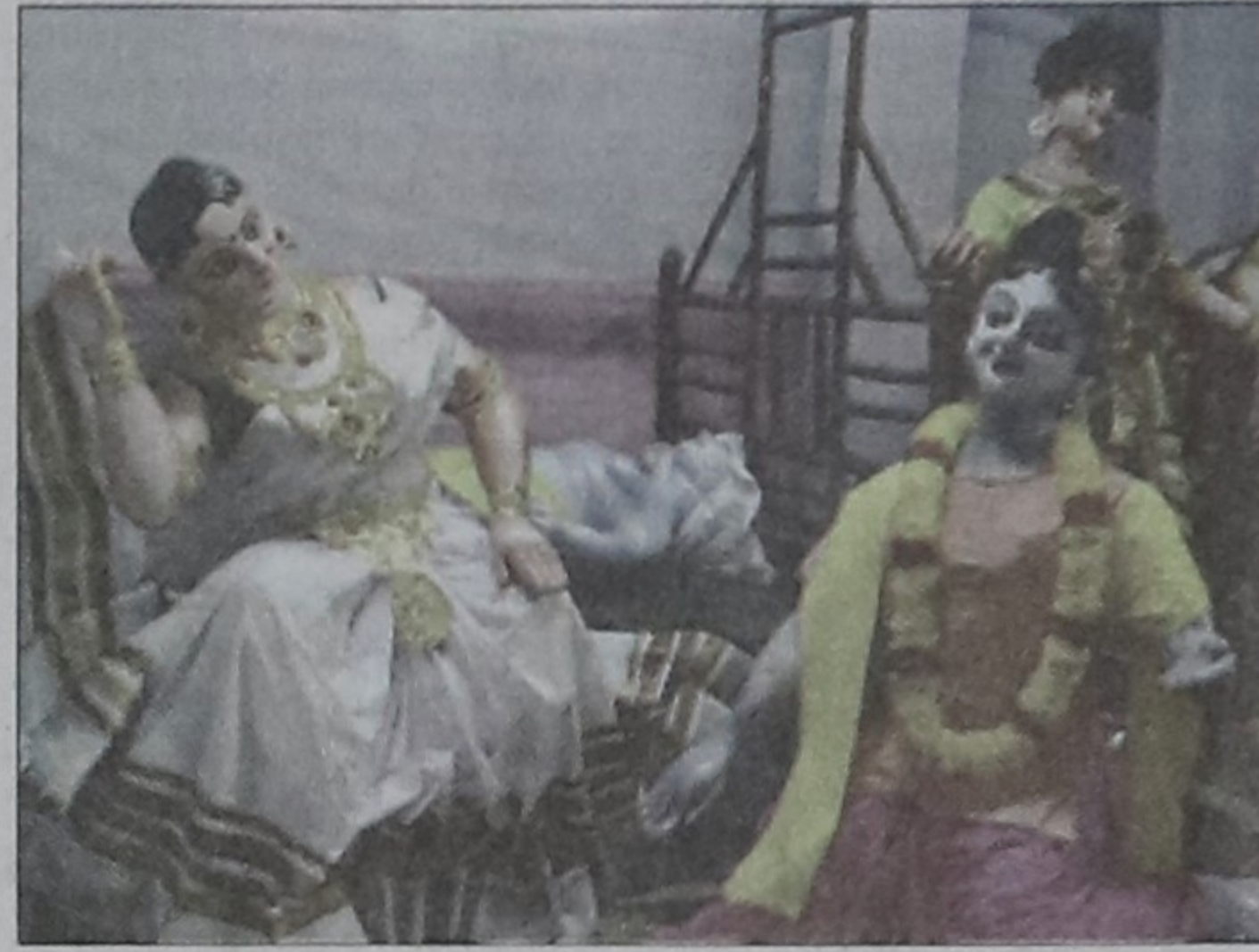
Clay and straw-made deities featured at the fair

The artists also added that such initiatives would help them to generate income through pursuing their ancestral professions during the dry season. Other idol makers who have lent their exper-