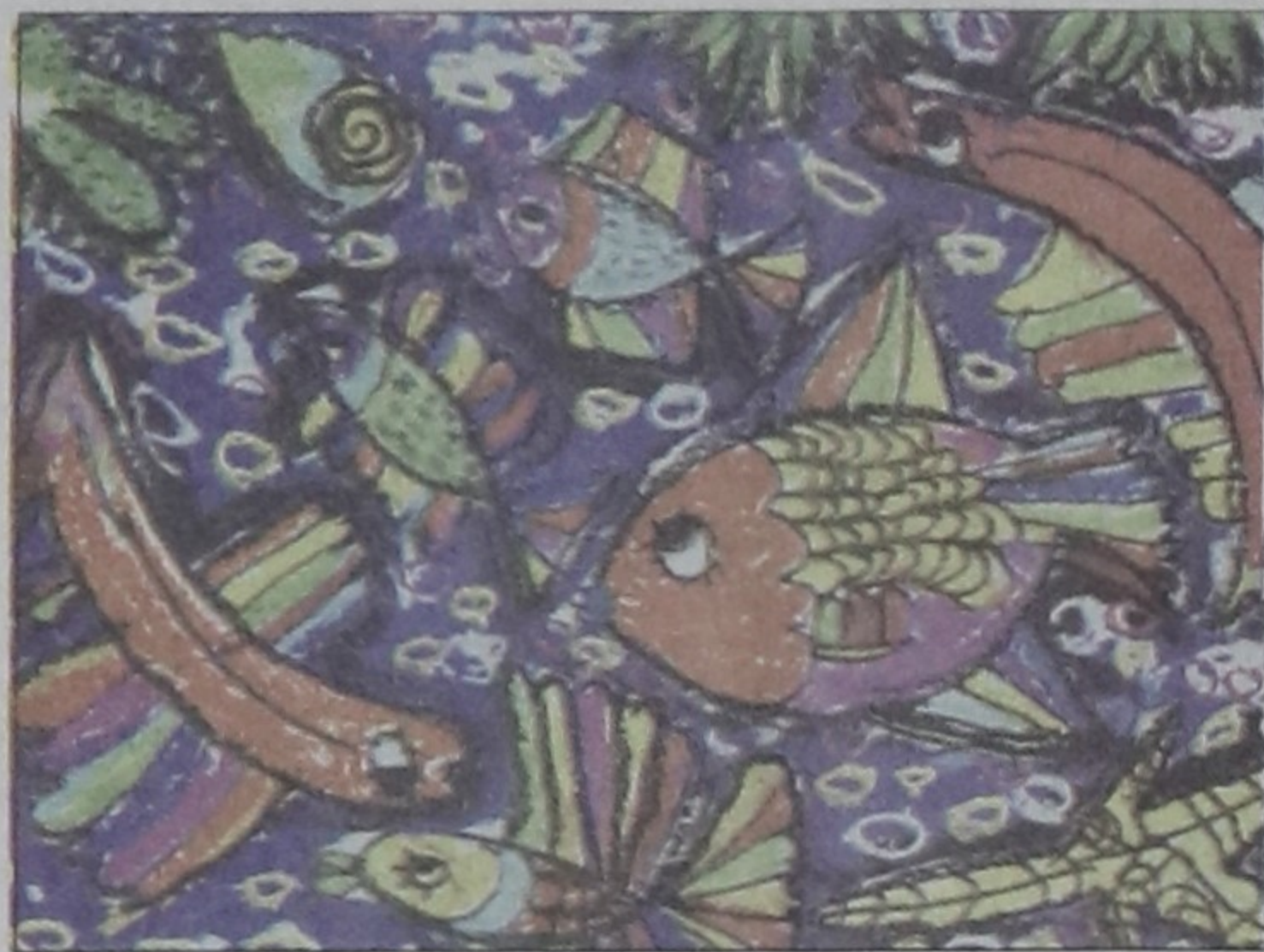
Art works by Syeda Naziza Ahmed and Suriya Yasmin Miasha

Suriya Yasmin Miasha's work is filled with fish of different shapes and sizes with gills, fins and large eyes. Orange, yellow and blue are the colours of the subject while the background is royal blue, full of underwater plants and other circular beings, done in white and blue.