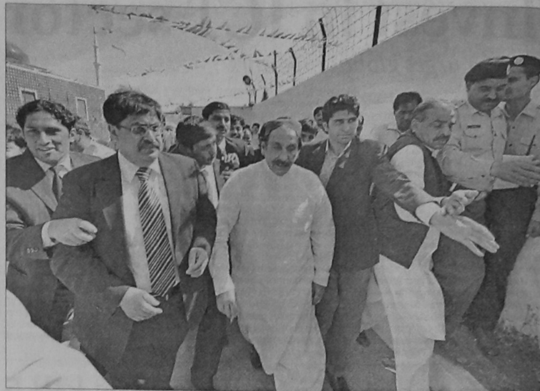
Pakistani anti-Musharraf lawyers escort deposed Pakistani Supreme Court Chief Justice Iftikhar Muhammad Chaudhry (C) as he leaves the mosque after his first Friday prayer following his release in Islamabad yesterday.

While Pakistan is unlikely to entertain the possibility of talks with foreign militants linked to al-Qaeda, the government could be willing to negotiate with pro-Taliban fighters mounting attacks on Pakistani security forces and suspected of attacks in Afghanistan.