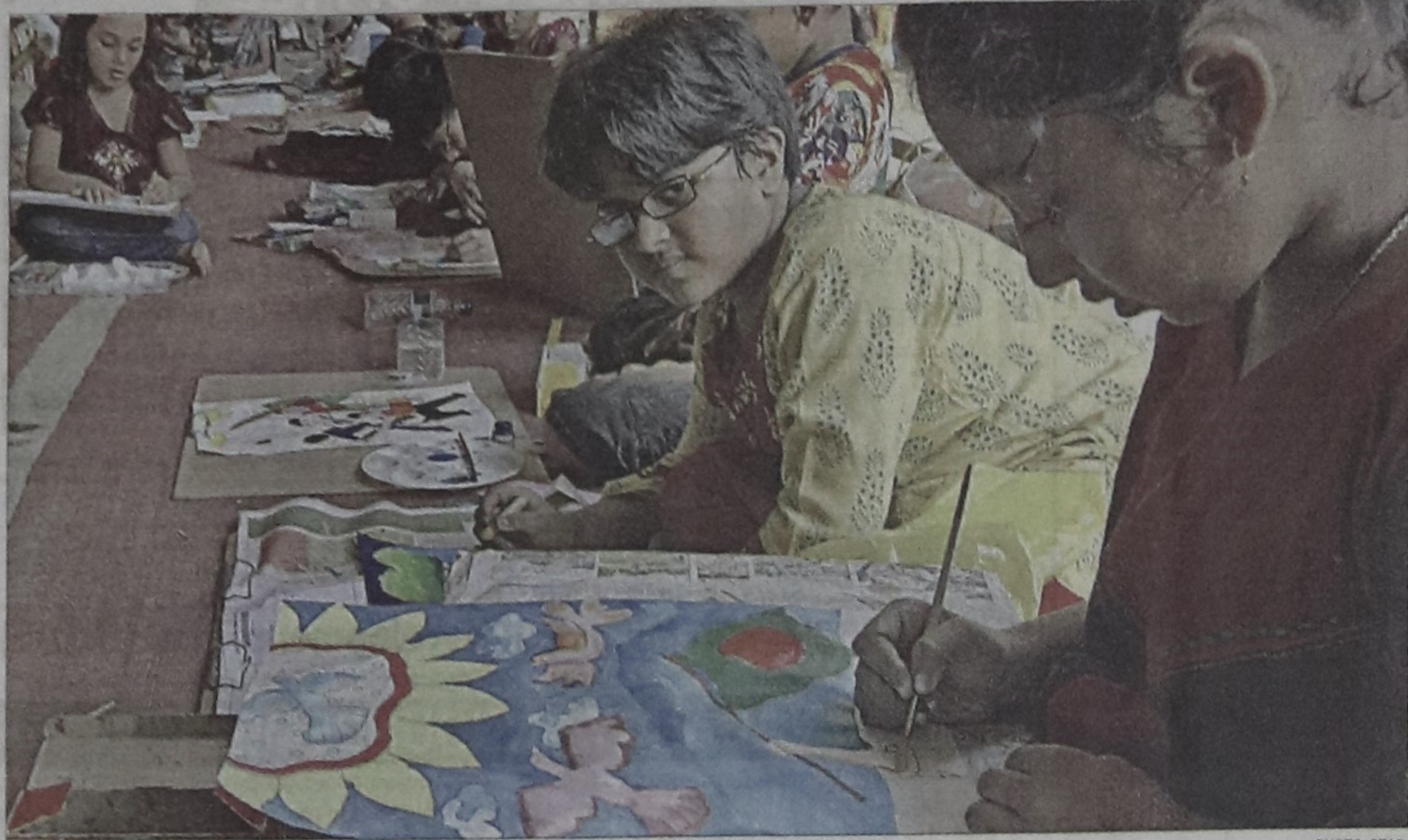
Children draw pictures at the Institute of Fine Arts on the Dhaka University campus yesterday. Gazi Toys School Bichitra, a magazine for school children, organised the drawing competition on the occasion of the Independence Day.