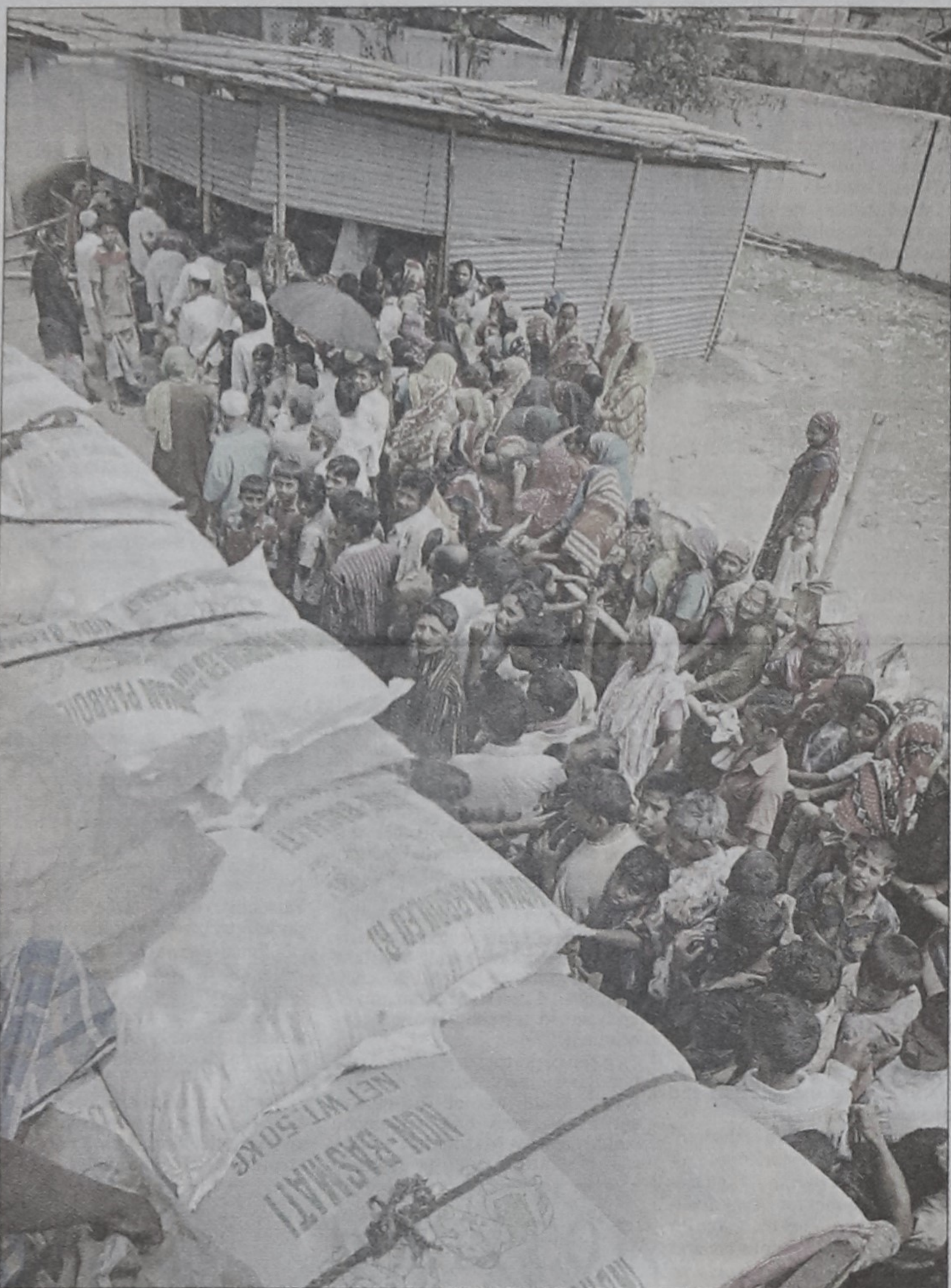
People overwhelmed by the high prices of essentials stand in long queues in a field at Nawabganj in Old Dhaka yesterday to buy rice from a BDR fair price shop.