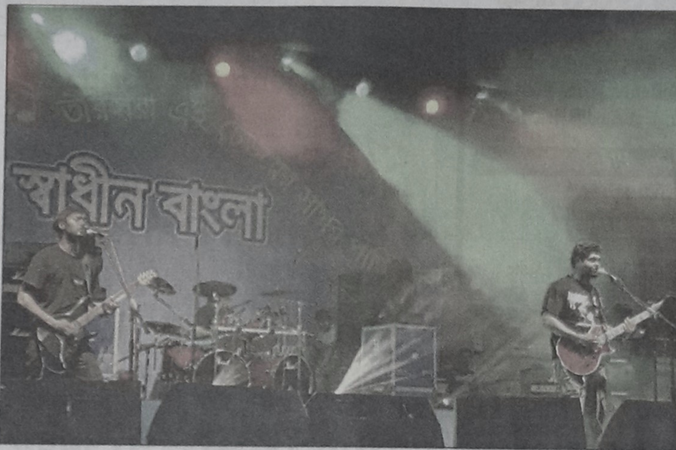
Artcell performs at the programme