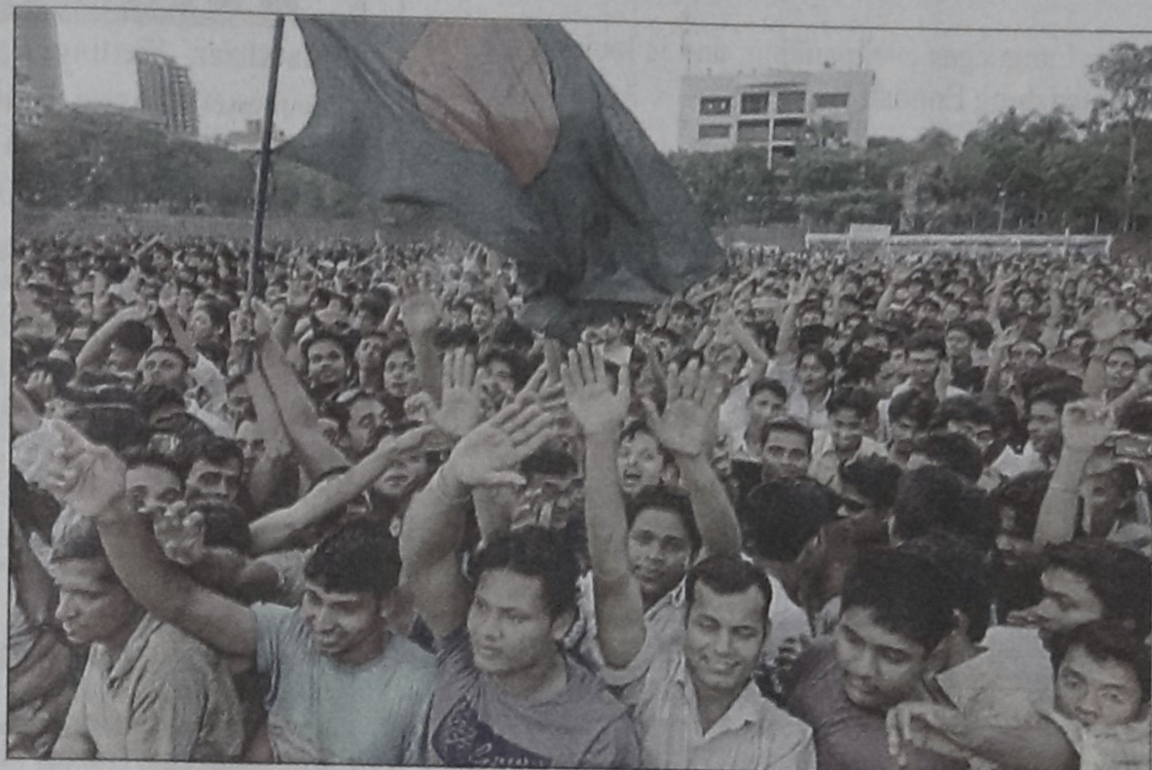
A view of the enthusiastic crowd at the concert