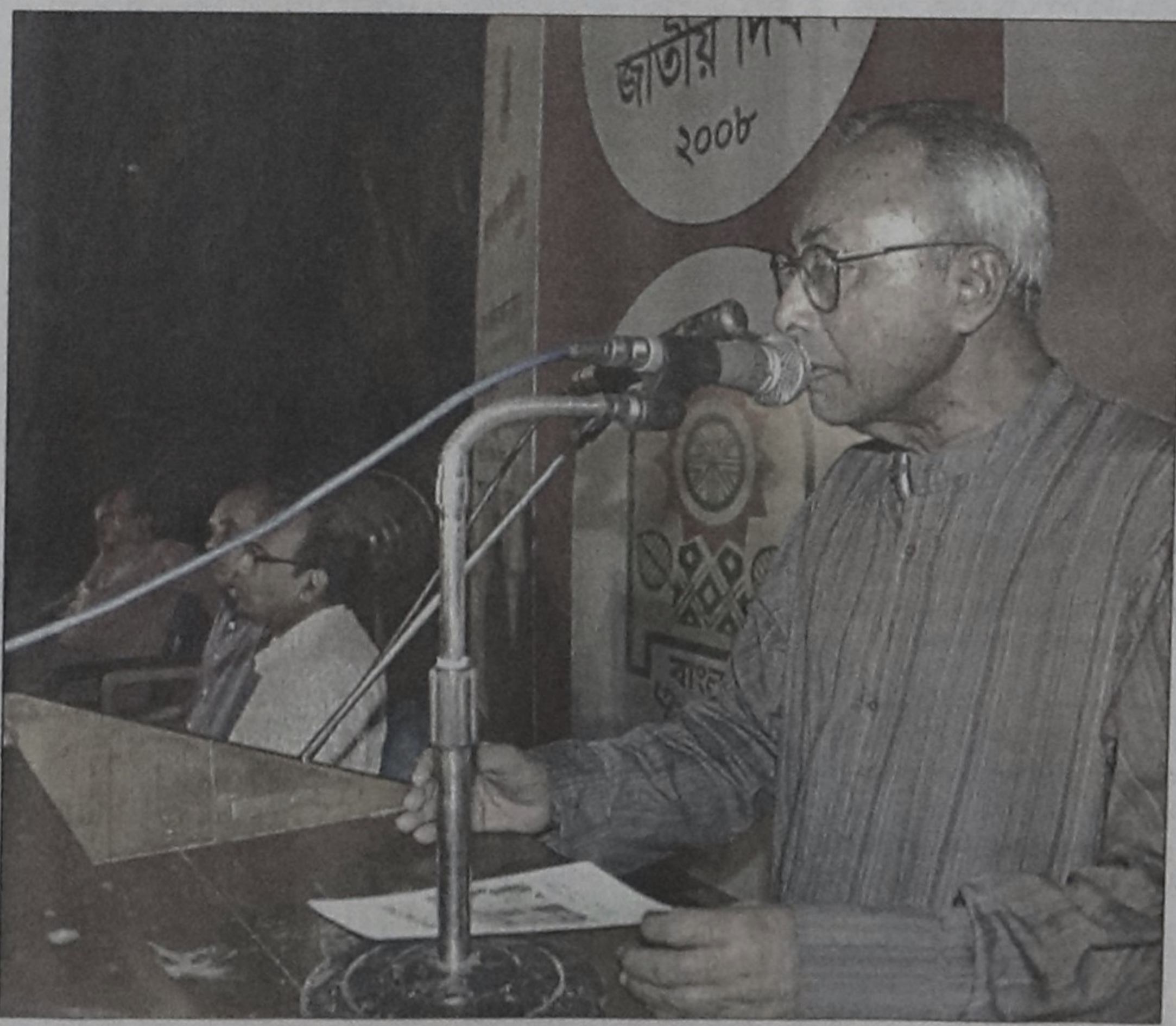
Professor Rafiqul Islam speaks at the programme

Ferdous Ara rendered Amar mon choley jay and Boltey paro shey kon desher . Fakir Alamgir and Rebeka Sultana rendered Daam diye kinechi Bangla and Ek shagor roker binimoye respectively. Syed Rezaur Rahman sang Shono ora kije boley , a song on the Language Movement.