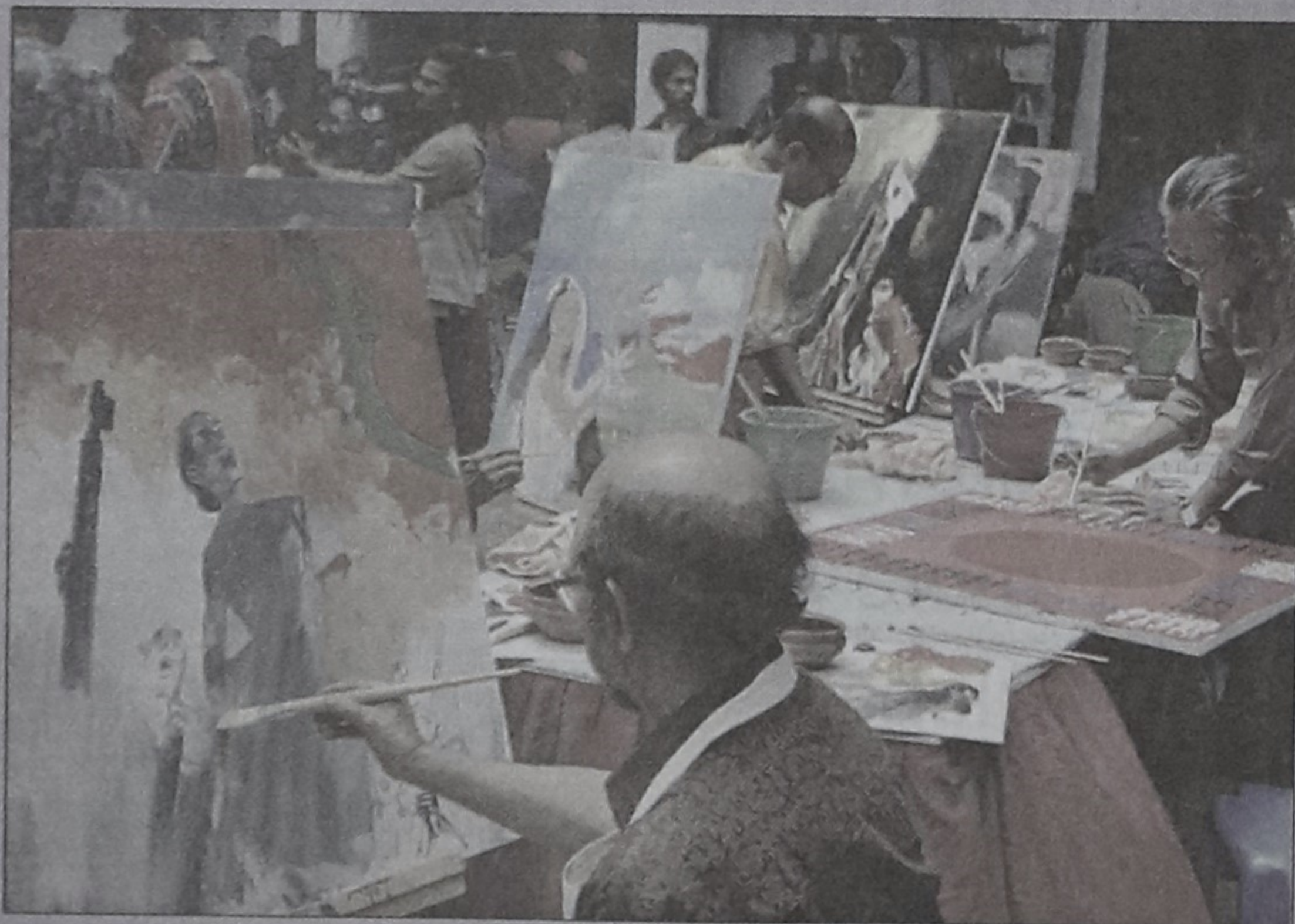
Eminent artists engrossed in work at the Liberation War Museum

According to the organisers, Liberation War Museum will soon arrange an auction of the artworks.